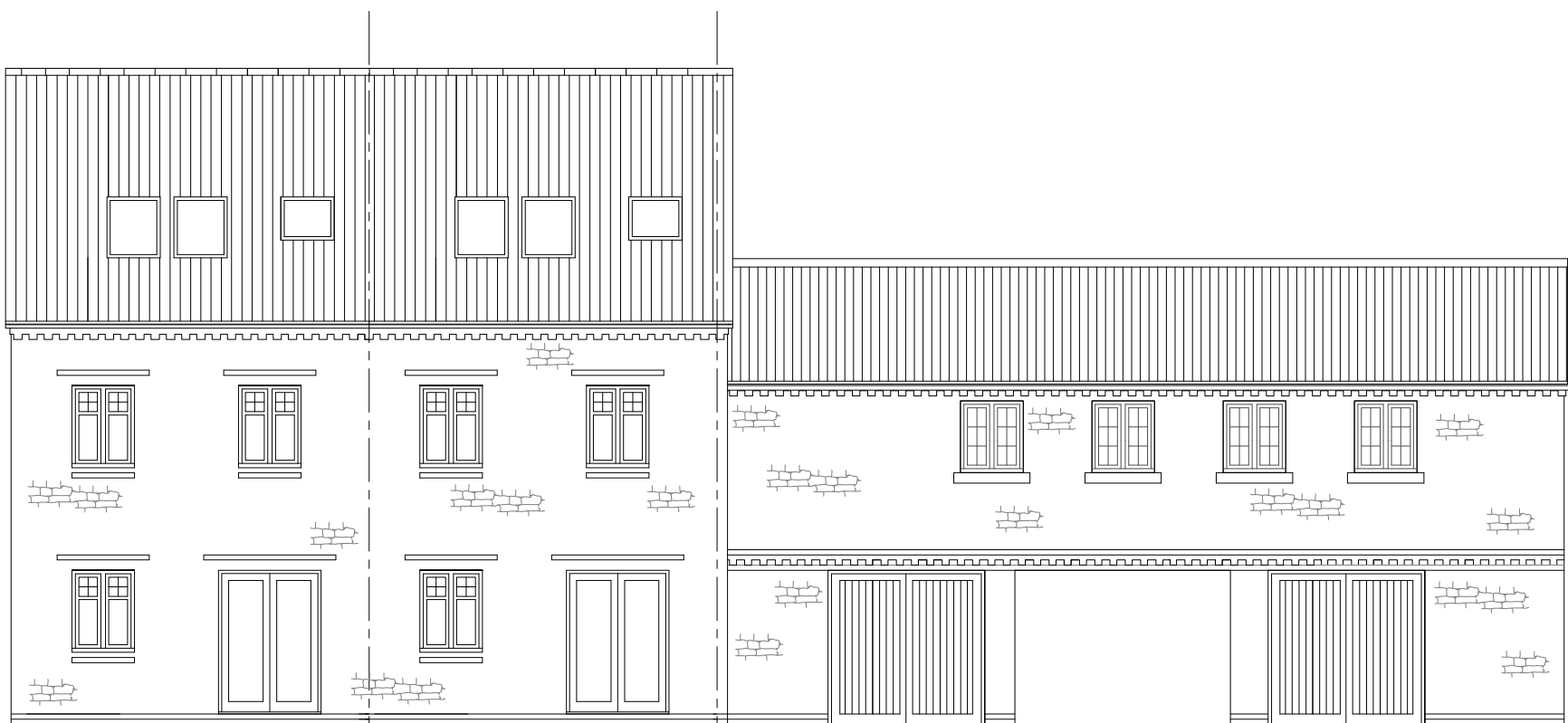
T310 T310 REAR ELEVATION