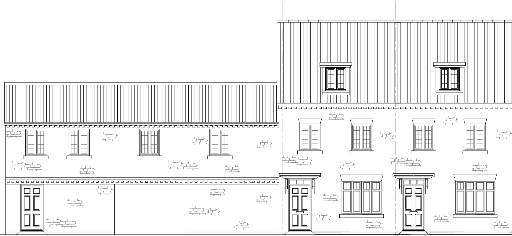
P230 FRONT ELEVATION