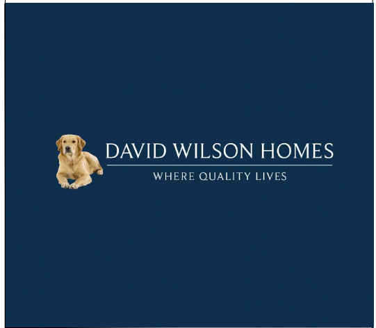
The Bloxham P382