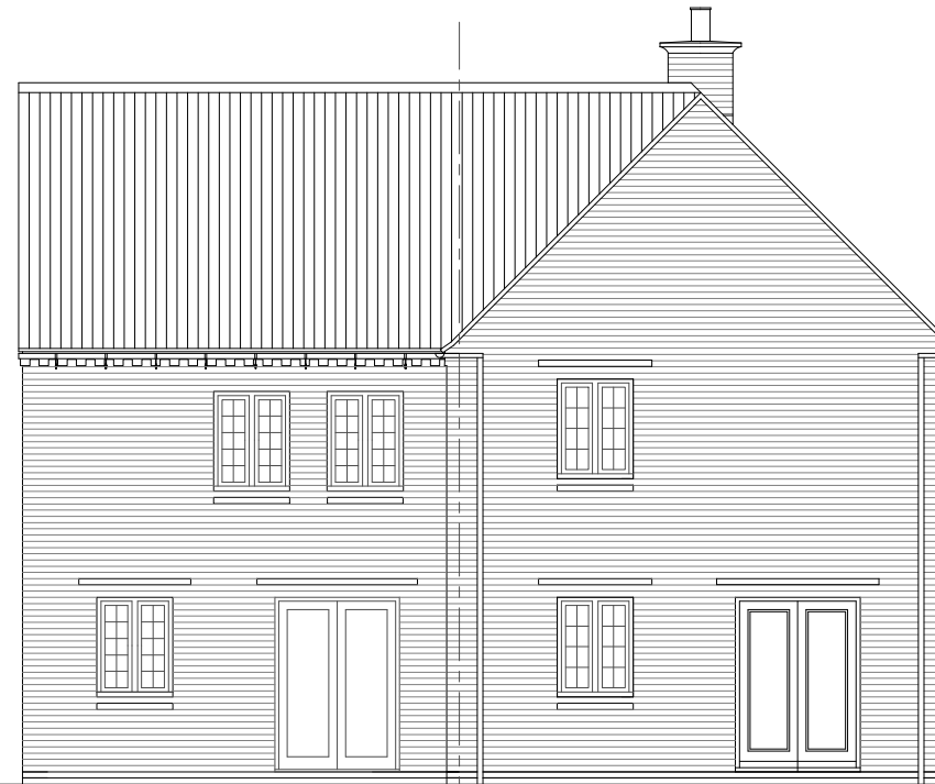
P382 P341 REAR ELEVATION