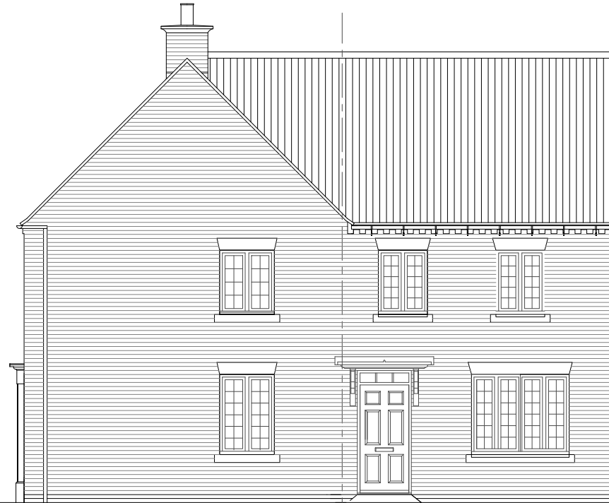
P341 P382 FRONT/SIDE ELEVATION