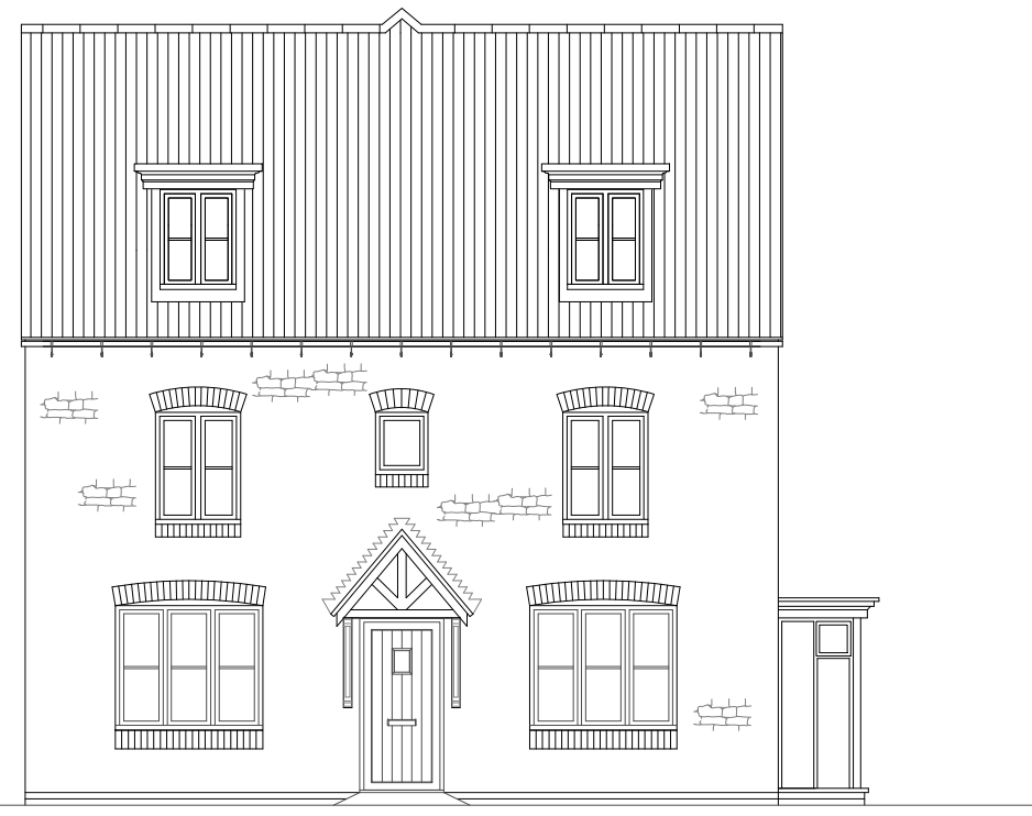
FRONT ELEVATION 2