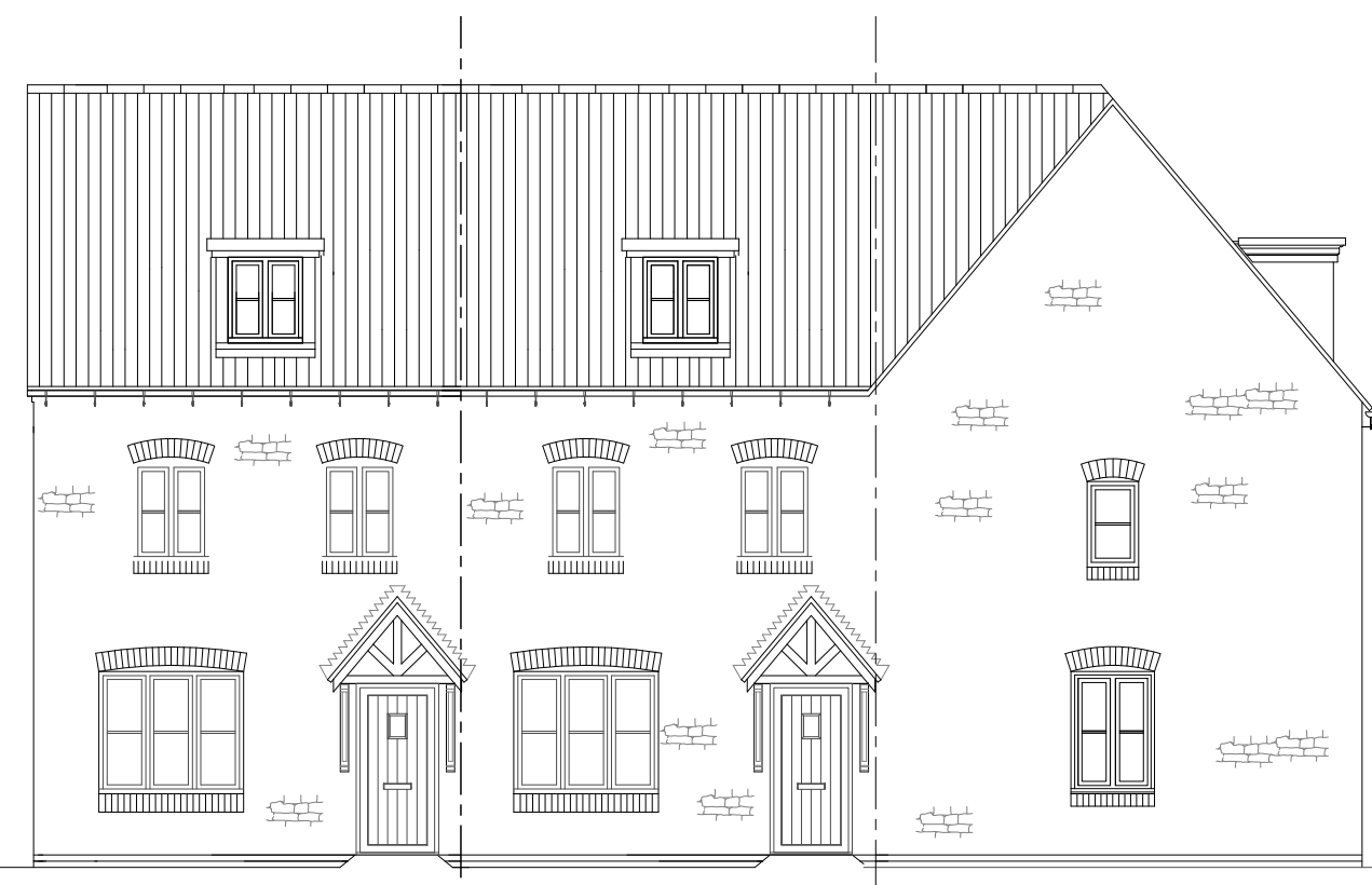
FRONT ELEVATION 1