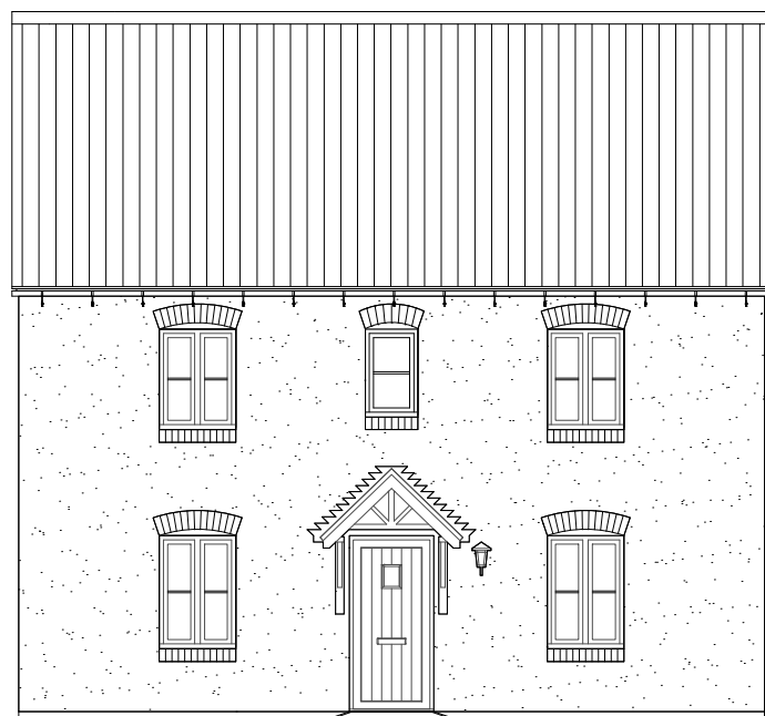
FRONT ELEVATION 1