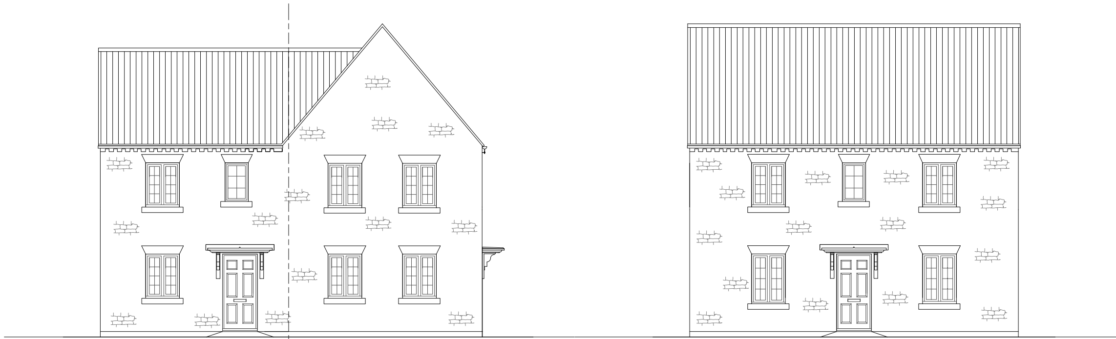
FRONT ELEVATION 1