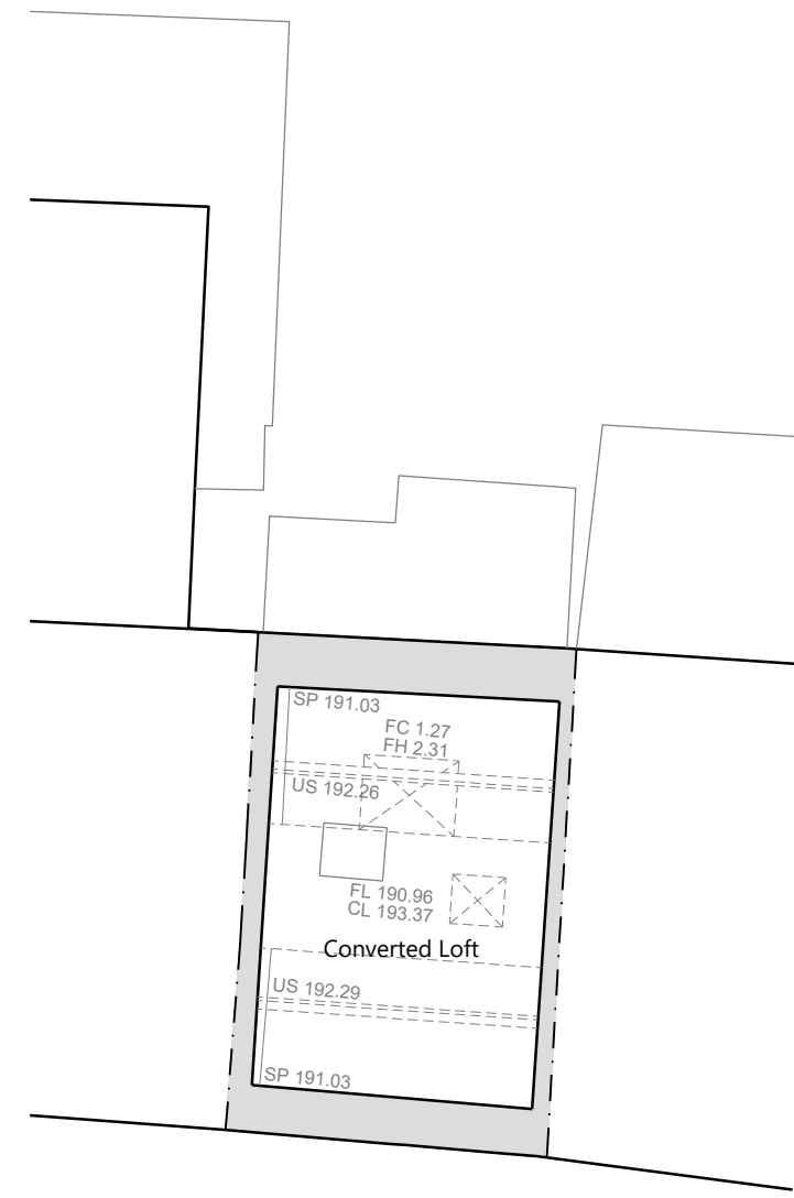
Existing Second Floor Plan Scale: 1:100