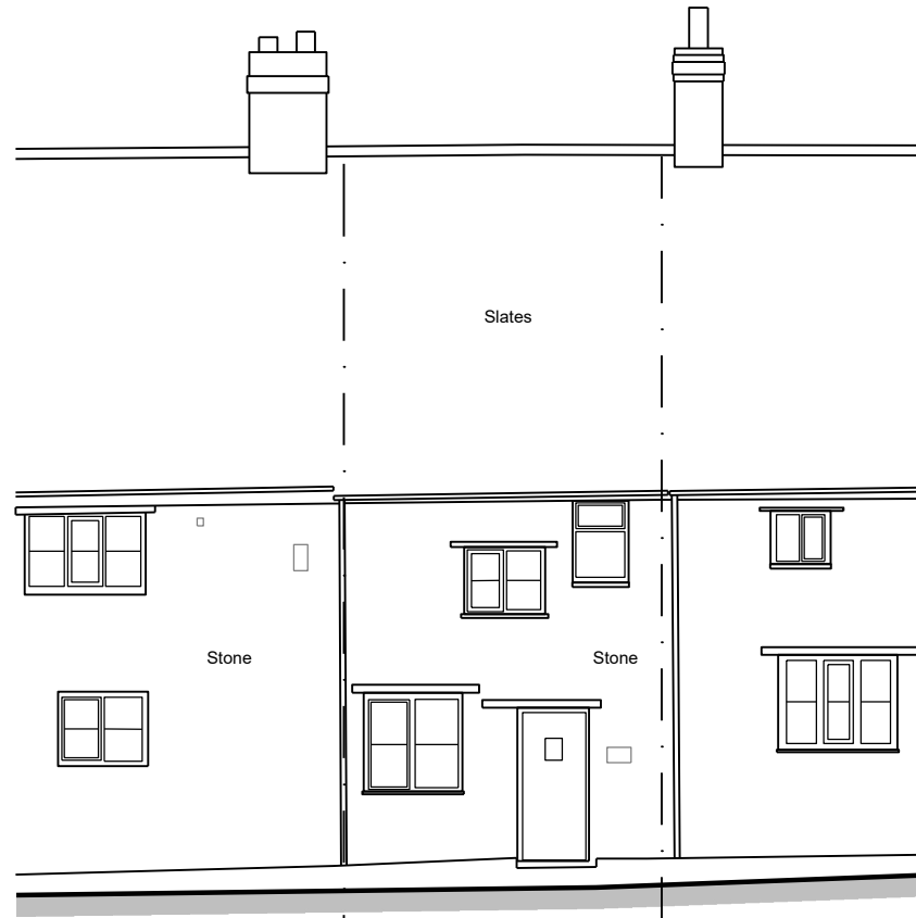
Proposed South (Front) Elevation Scale: 1:100