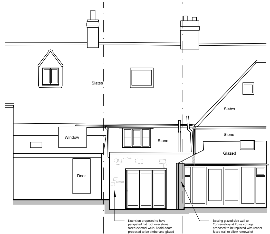
Proposed North Elevation Scale: 1:100