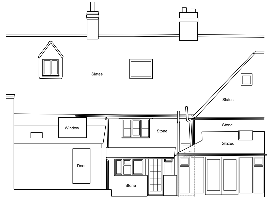
Existing North Elevation Scale: 1:100