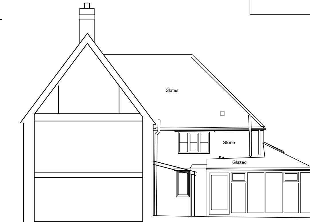
Section A - A / Elevation facing West Scale: 1:100