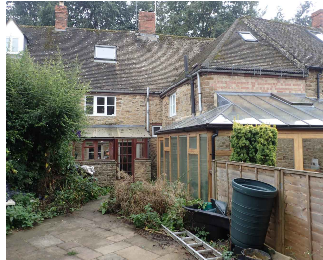
Image showing existing arrangement to rear of Clematis and Rufus Cottage