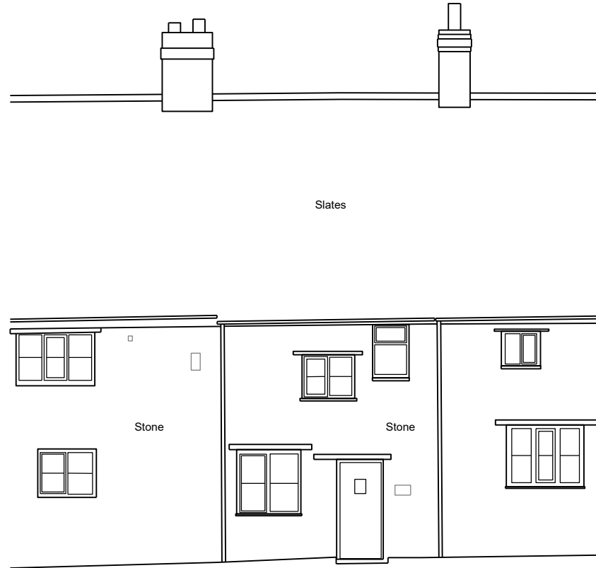
Existing South (Front) Elevation Scale: 1:100