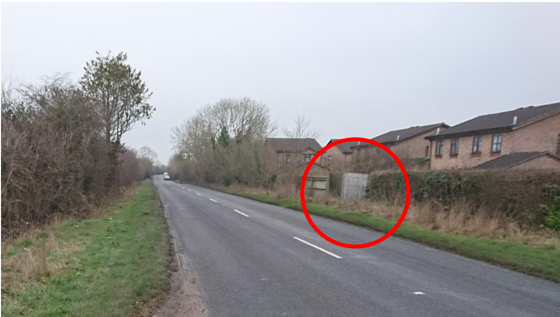
Figure 1: Point at which existing footway joins Howes Lane on the east.

The proposed Toucan Crossing is shown 'in line' with the existing footway link to Wansbeck Drive and the proposed footway / cycleway into the residential development. As such, pedestrians or cyclists approaching the crossing facility may do so at inappropriate speed increasing the likelihood of NMUs failing to stop before entering the carriageway. This may increase the risk of collisions with approaching vehicles. A guardrail 'chicane' is present at the western end of the existing footway link to Wansbeck Drive to mitigate against this, but a similar arrangement is not proposed on the western side of Howes Lane.