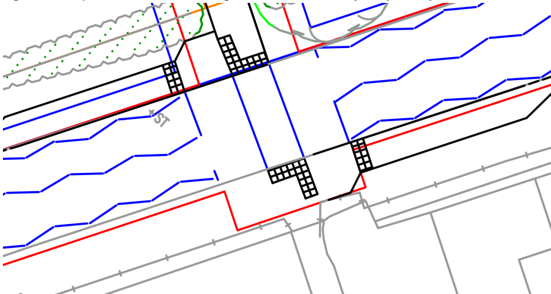
Figure 2: Proposed Toucan Crossing 'in line' with footways / cycleways.

The proposed Toucan Crossing is shown 'in line' with the existing footway link to Wansbeck Drive and the proposed footway / cycleway into the development. As such, pedestrians or cyclists approaching the crossing facility may do so at inappropriate speed increasing the likelihood of NMUs failing to stop before entering the carriageway. This may increase the risk of collisions with approaching vehicles. A guardrail 'chicane' is present at the western end of the existing footway link to Wansbeck Drive to mitigate against this, but a similar arrangement is not proposed on the new footway / cycleway.