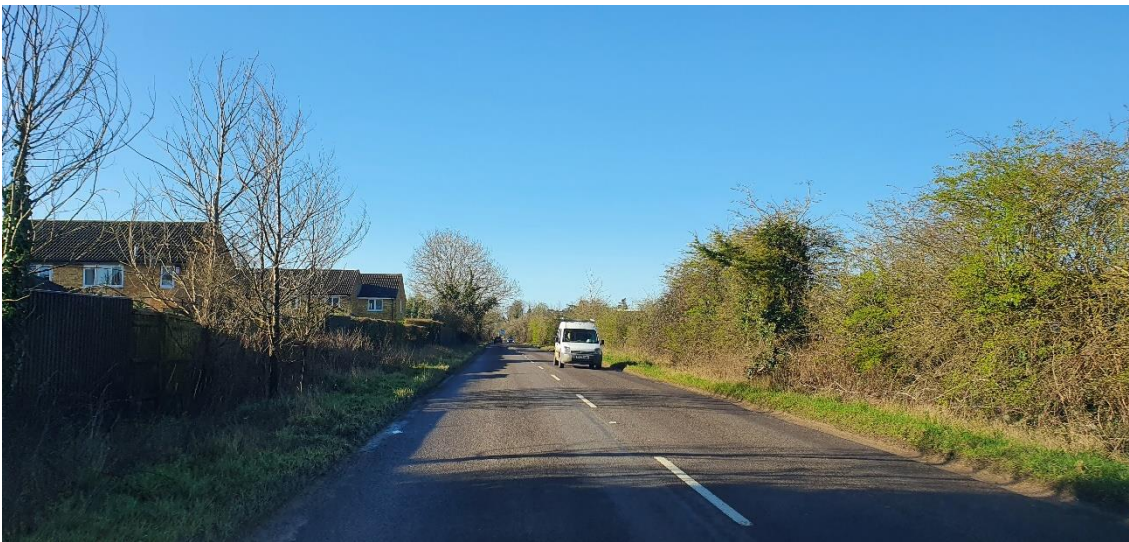
Figure 3: Lack of street lighting at location of proposed Toucan Crossing.

It is unclear whether street lighting is to be provided at the Toucan Crossing. A lack of street lighting may result in approaching motorists failing to observe a pedestrian / cyclist waiting to, or starting to, cross the carriageway. This may lead to an increased risk of collisions between crossing pedestrians / cyclists and approaching vehicles. This may be exacerbated by approaching motorists focussing on the traffic signals rather than pedestrians / cyclists who might cross contrary to the red crossing indicator.