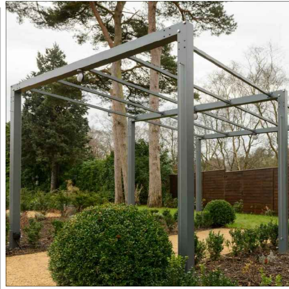
Harrod Contemporary Arch & Pergola Walkway