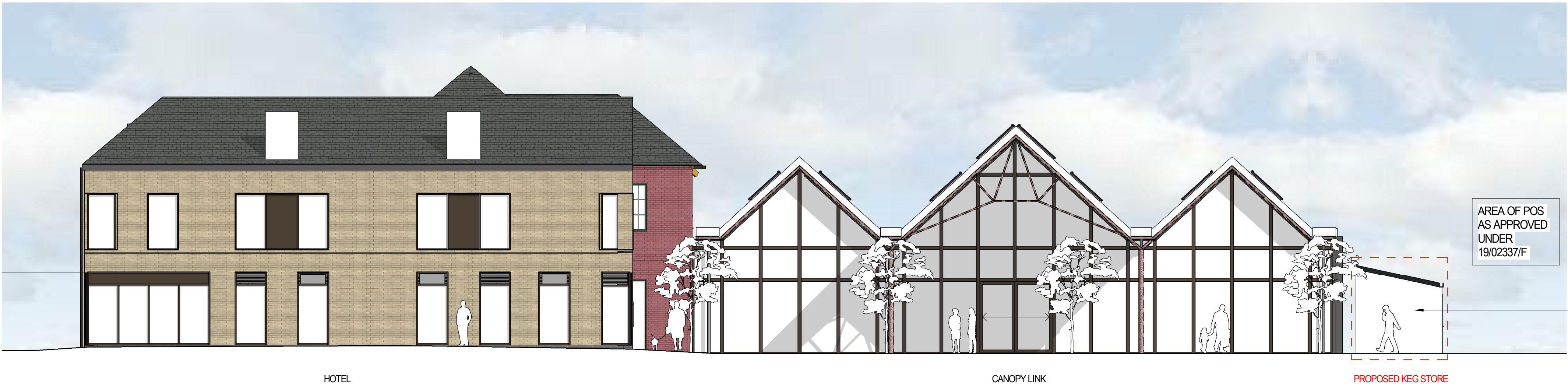
Canopy Link - Proposed North Elevation 1 : 100