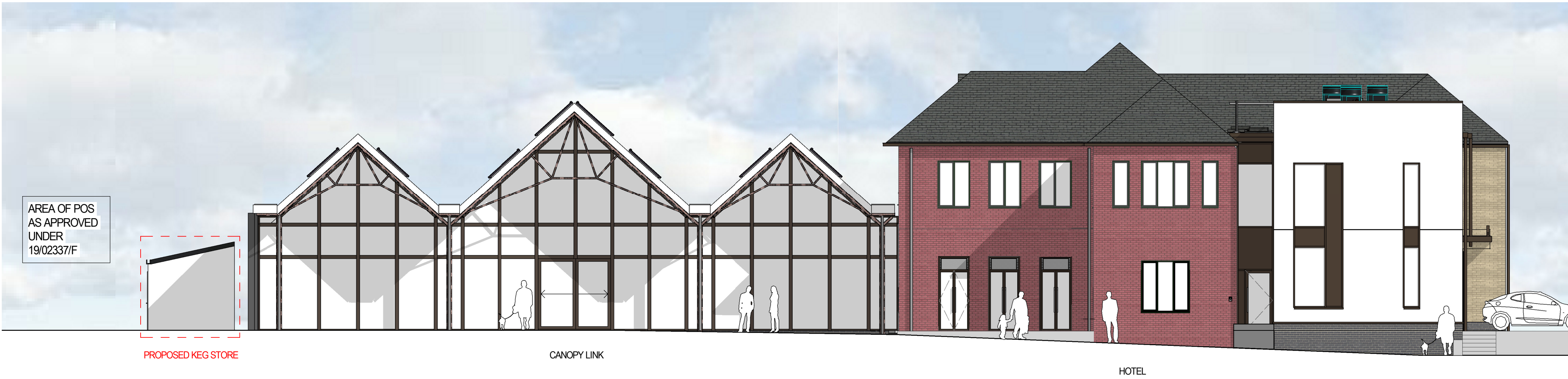
Canopy Link - Proposed South Elevation 1 : 100