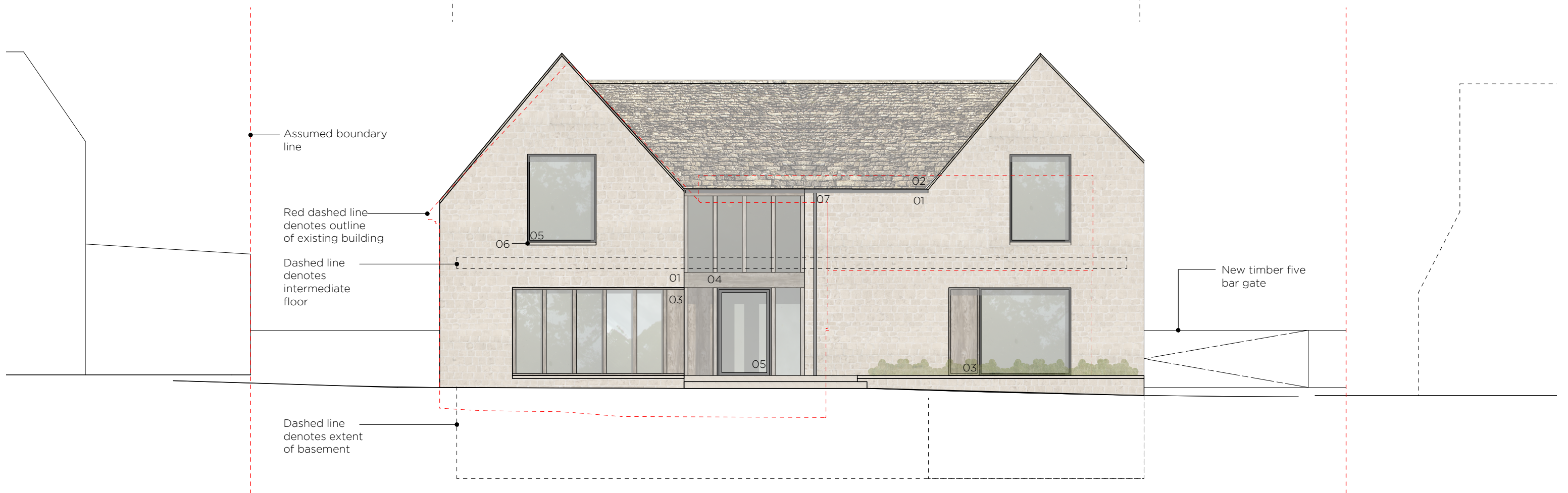
2 Proposed South Elevation Scale: 1:100