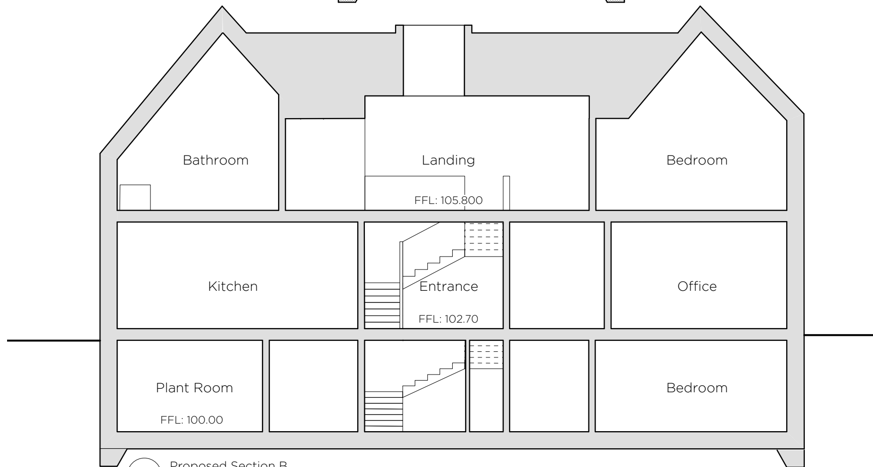
2 Proposed Section B Scale: 1:100