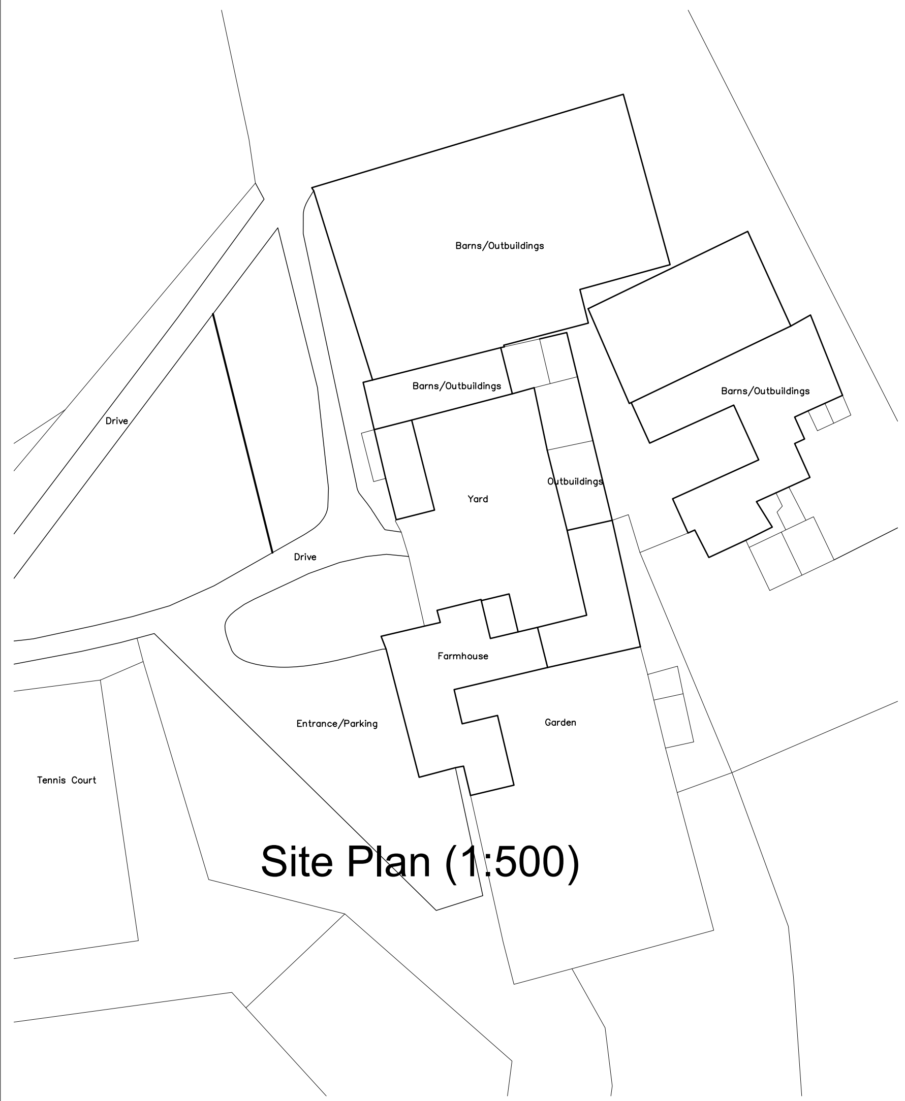
Site Plan (1:500)

Application site sits within whole farm owned by owners