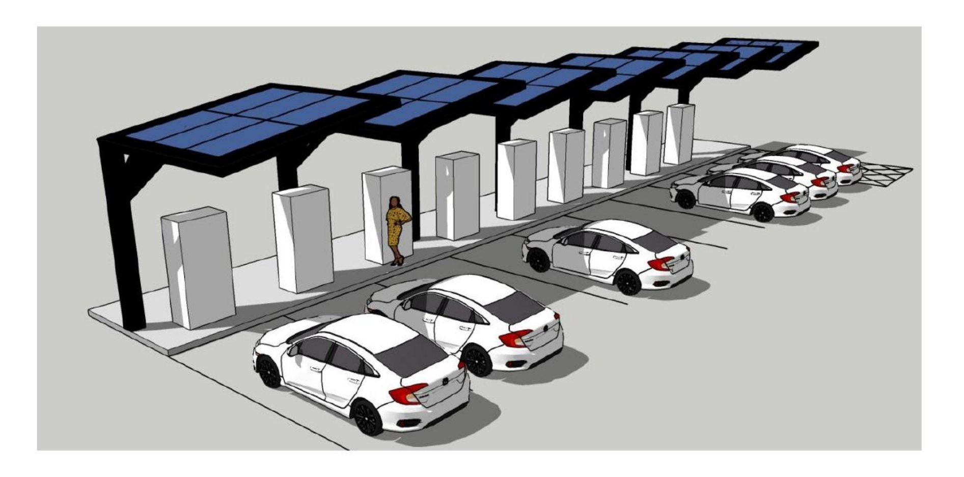
north west elevation