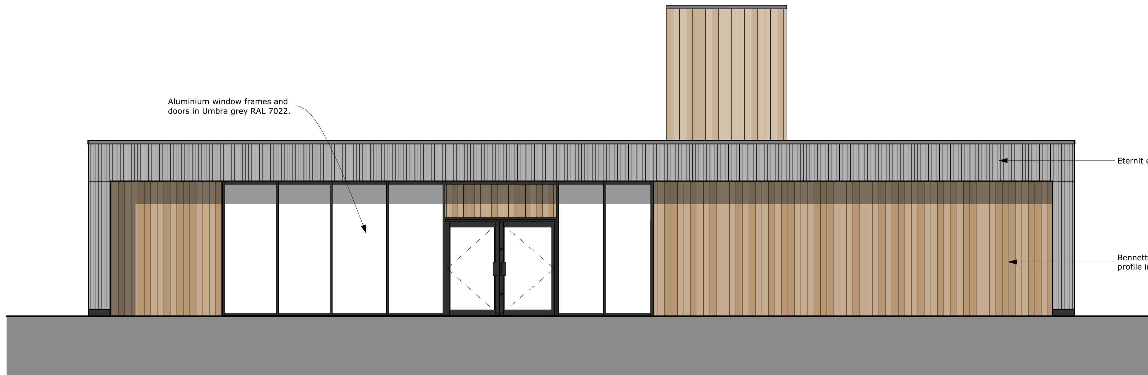
proposed se elevation 1:50