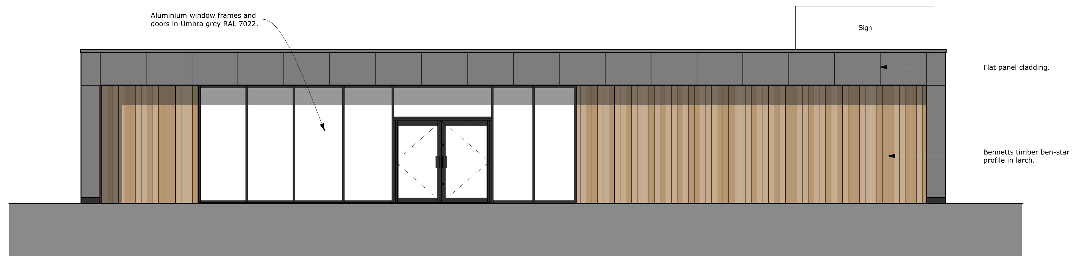
proposed ne elevation 1:50