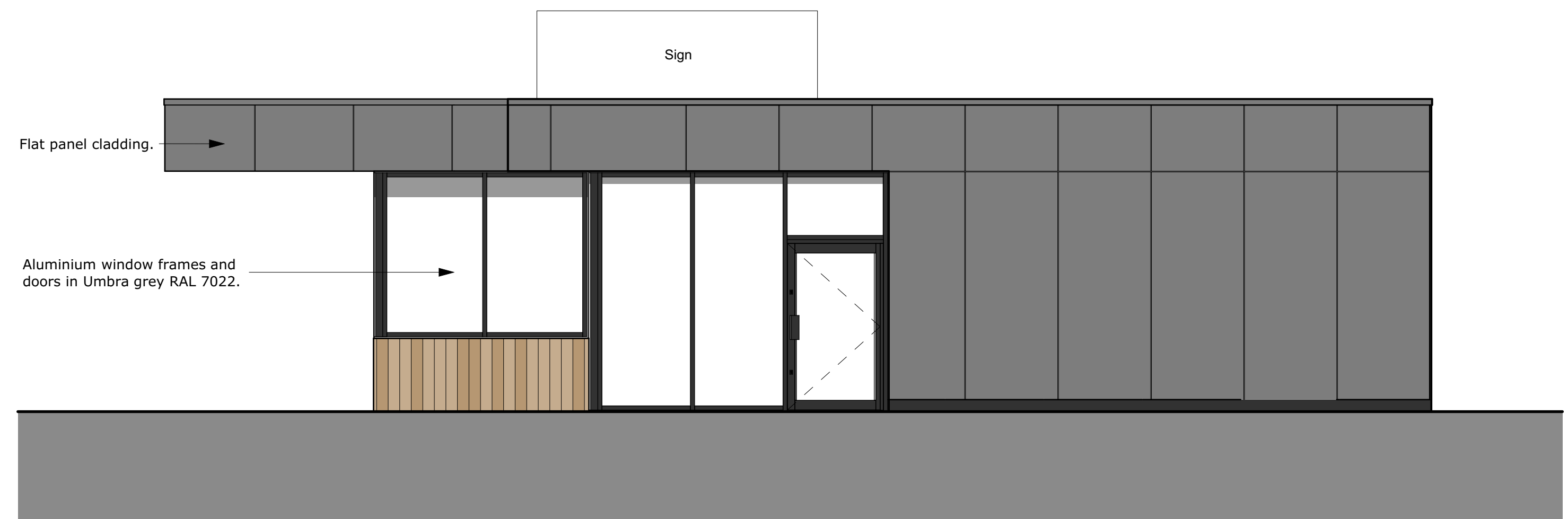
proposed se elevation 1:50