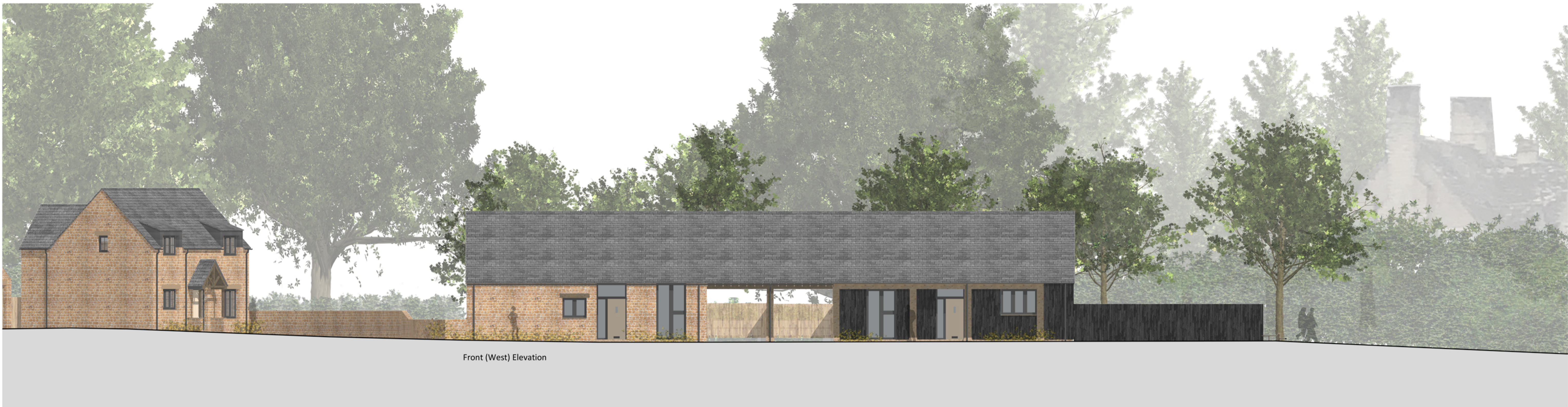
Front (West) Elevation