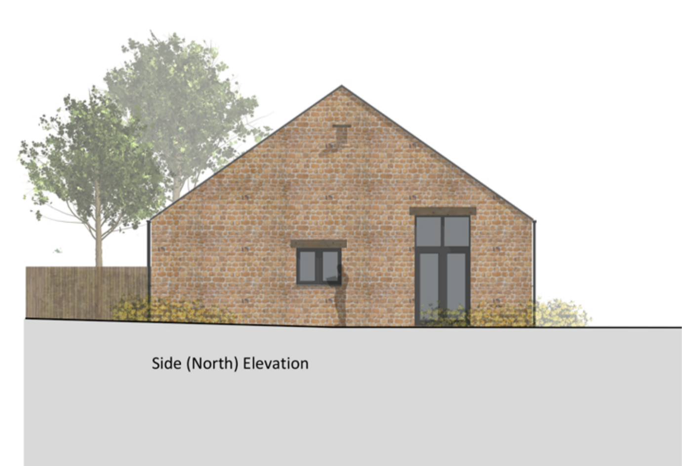
Side (North) Elevation