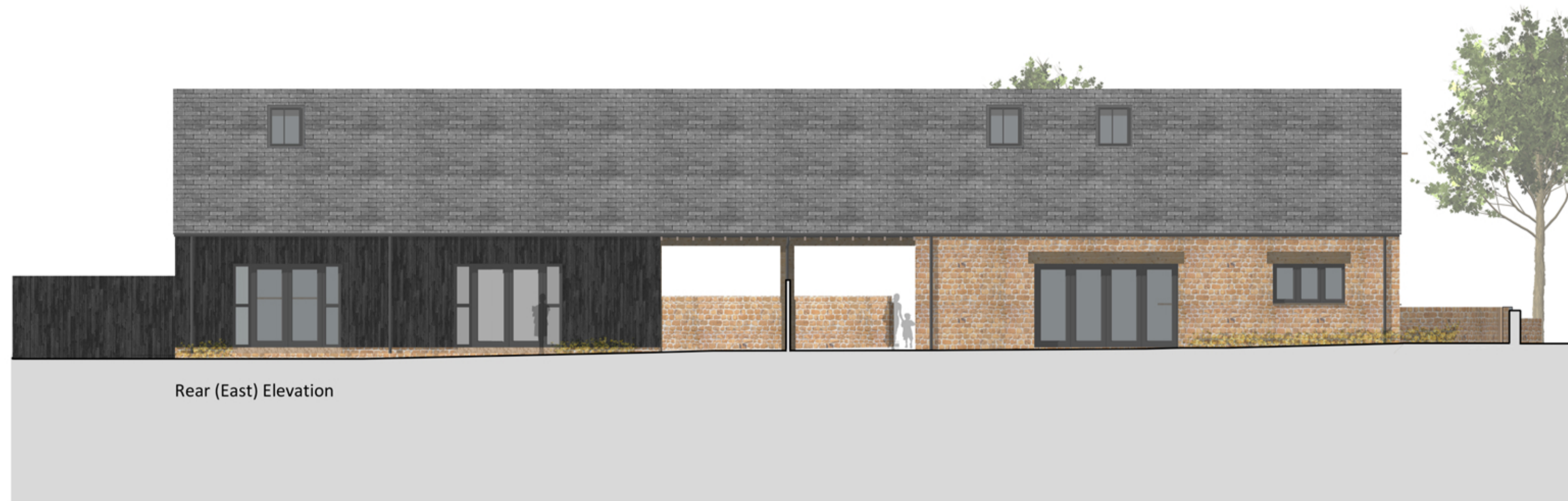
Rear (East) Elevation