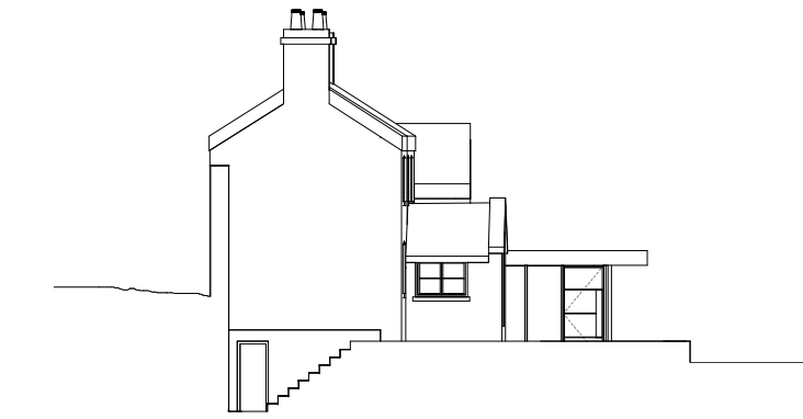
1 Existing West Elevation 1:100