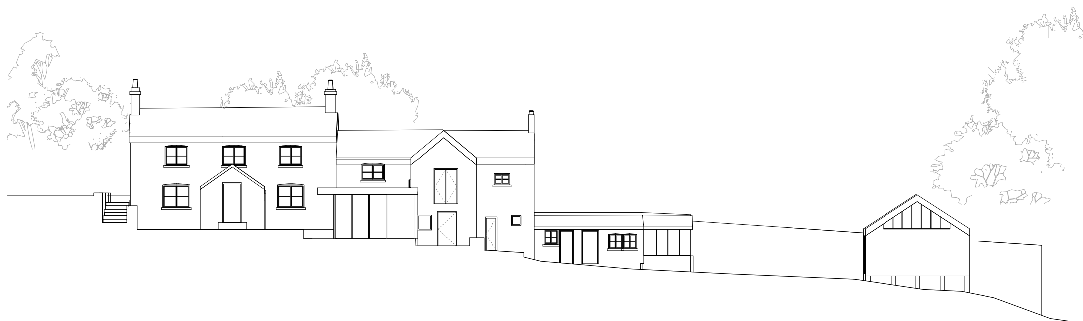
2 Existing South Elevation 1 : 100