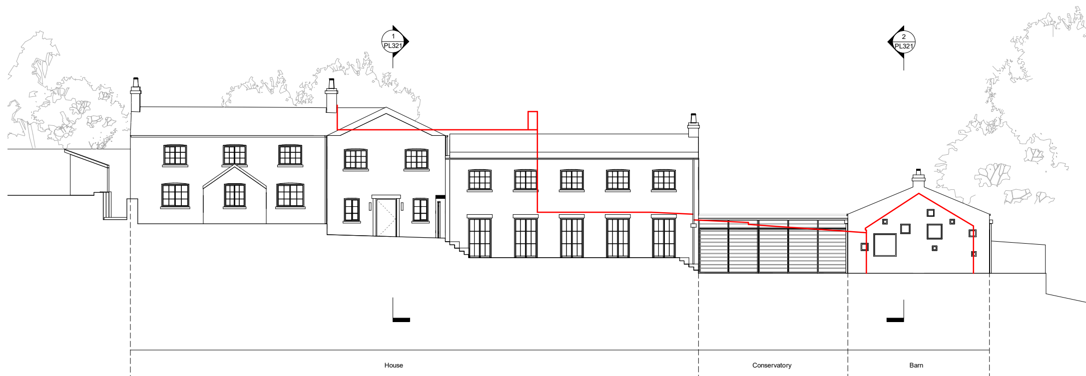
2 Proposed South Elevation 1 : 100