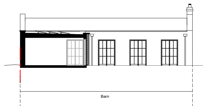
2 Proposed Barn West Elevation 1 : 100