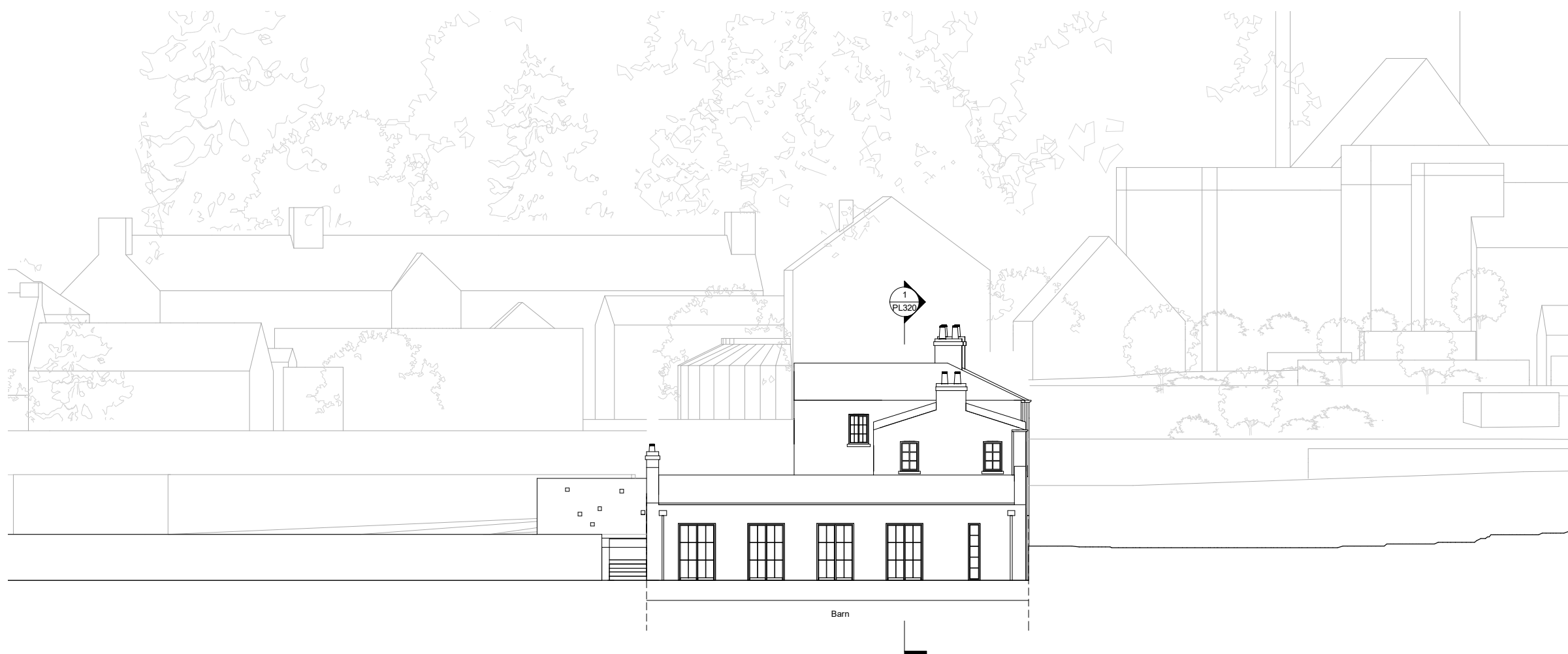
3 Proposed East Elevation 1 : 100