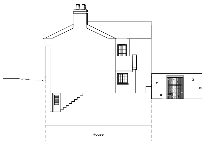
1 Proposed West Elevation 1 : 100