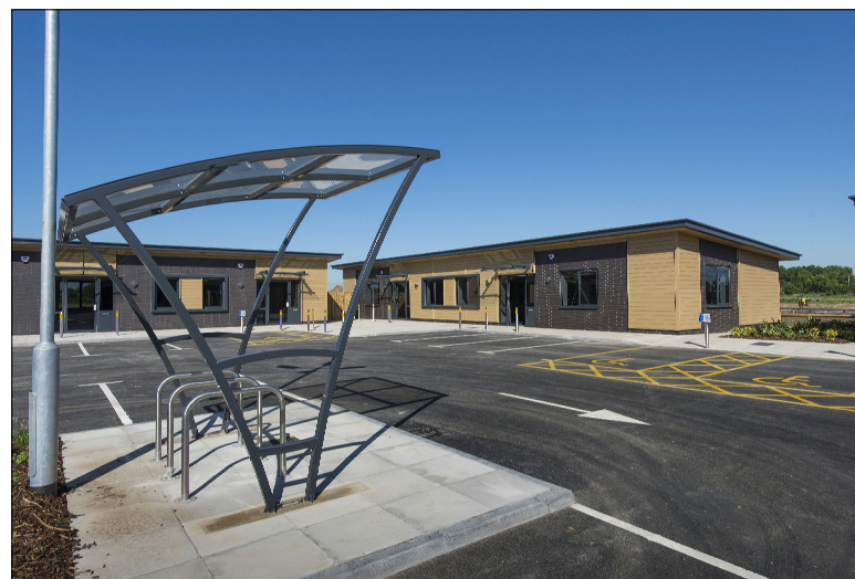
Indicative Visual of Cycle Shelter (NTS)

Please refer to The Harris Partnership drawing reference: 15987-105 Proposed Site Plan (latest revision) for location of proposed cycle shelter