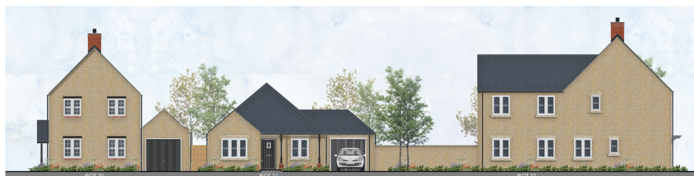
STREET SCENE F - F