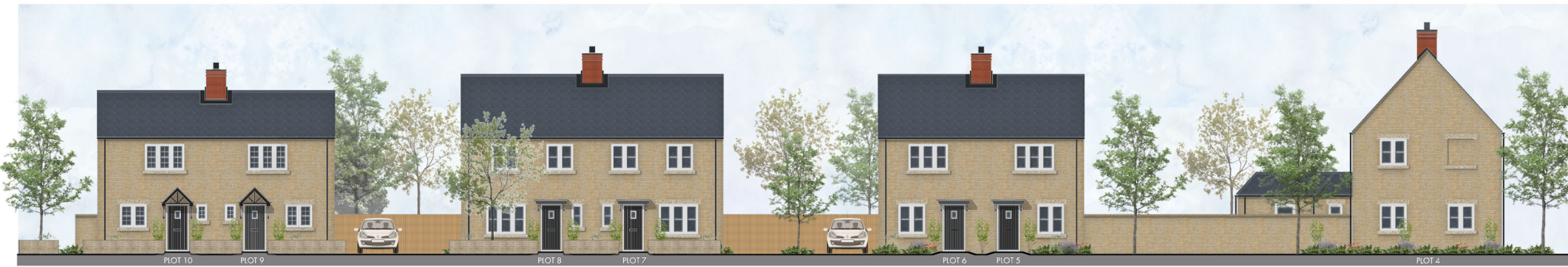
STREET SCENE B - B