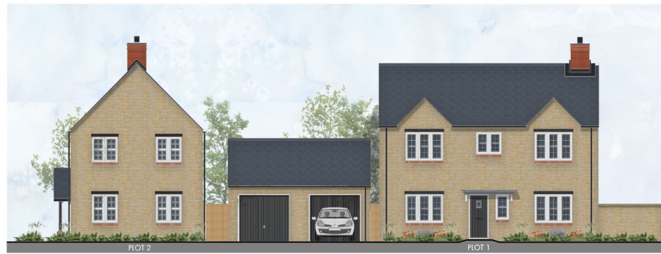
STREET SCENE A - A