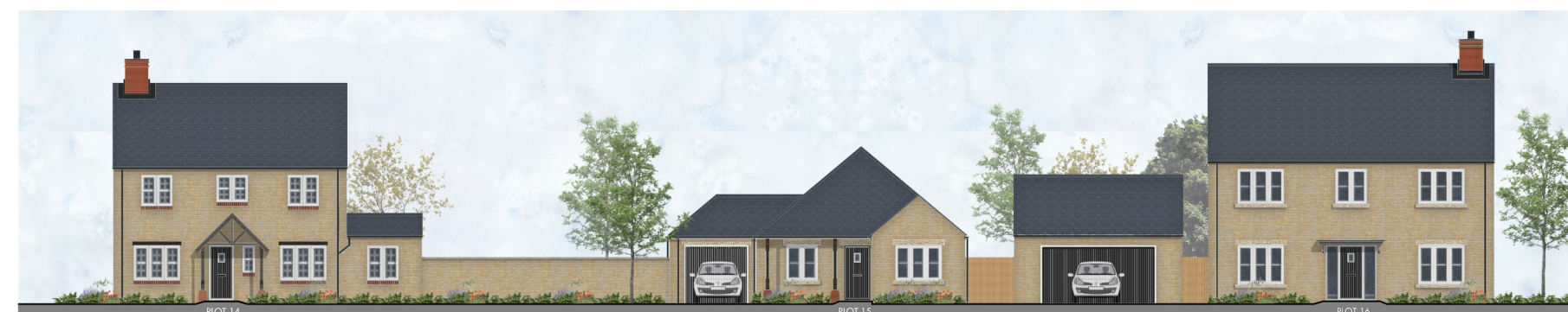
STREET SCENE G - G