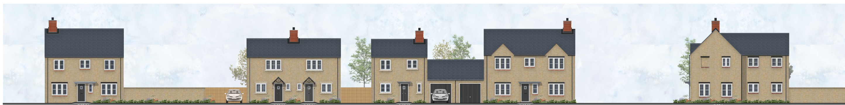
STREET SCENE E - E