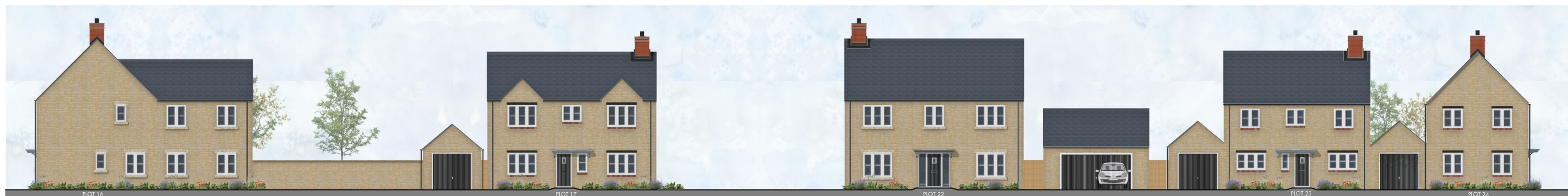
STREET SCENE D - D