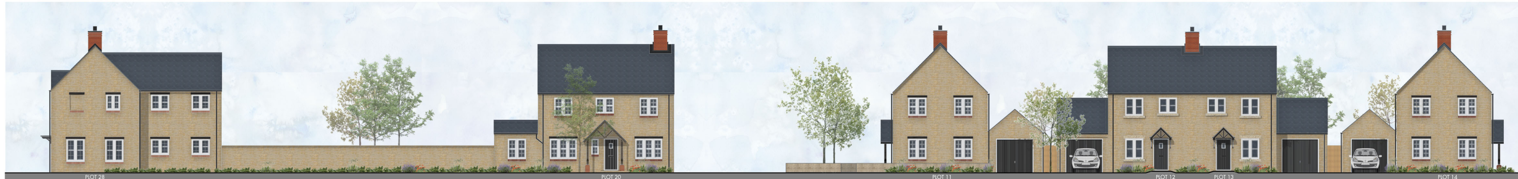
STREET SCENE C - C