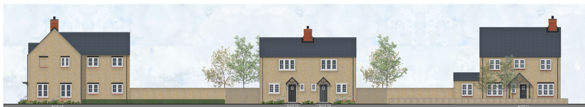
STREET SCENE H - H