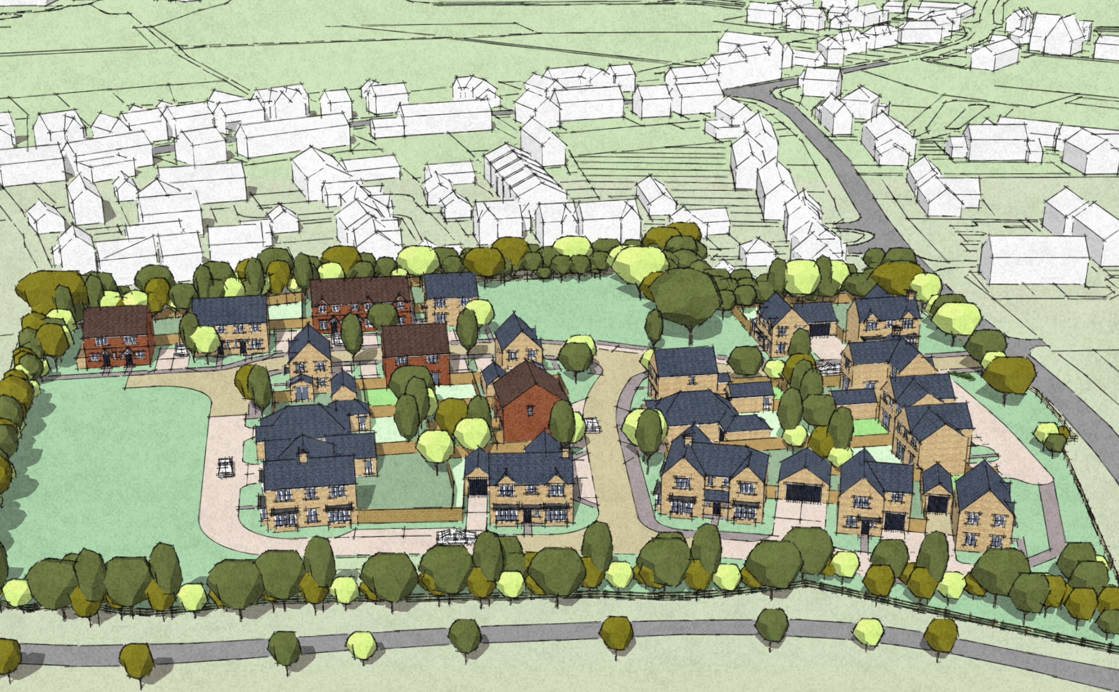
Illustrative Site Massing and Context