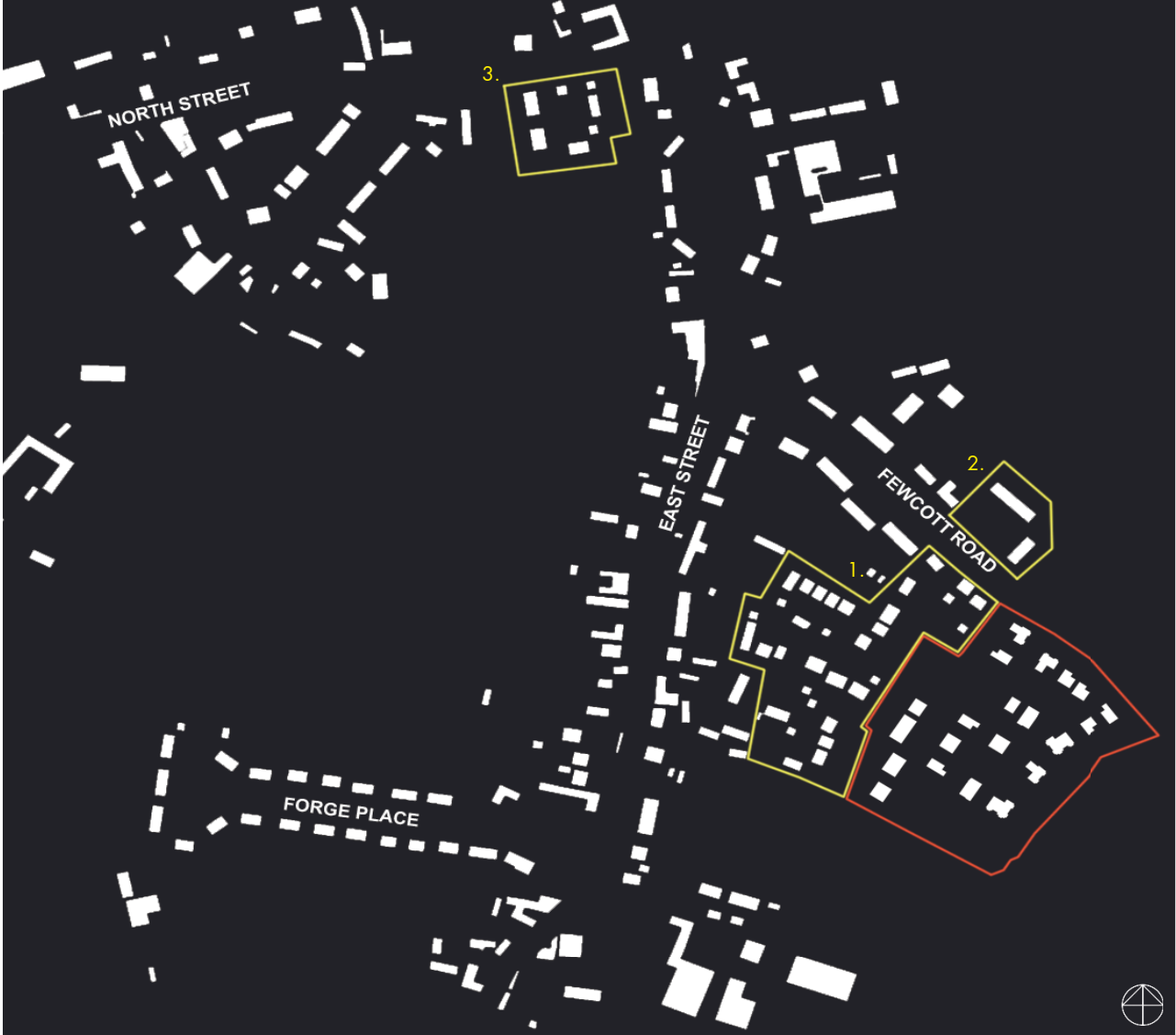
Figure Ground Plan - Site Layout Plan