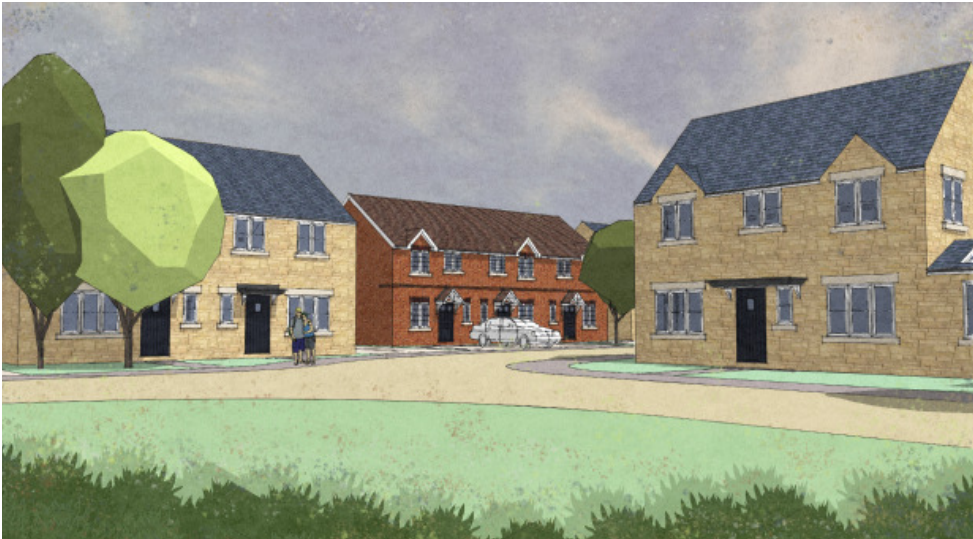
Illustrative View of Primary Road