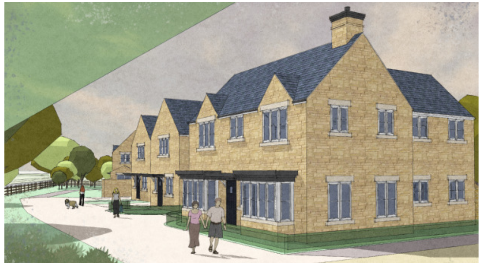
Illustrative View of Development Edge