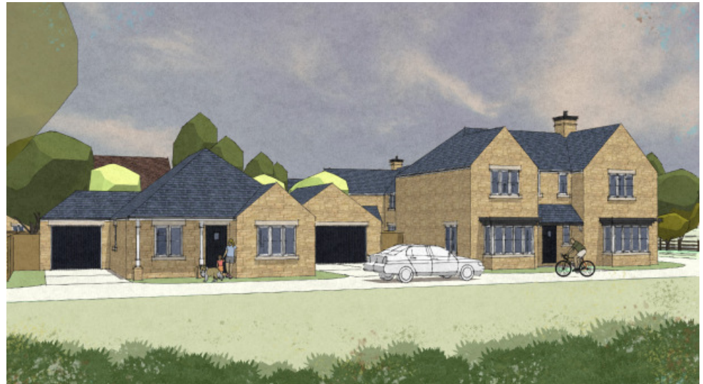
Illustrative View of Development Edge