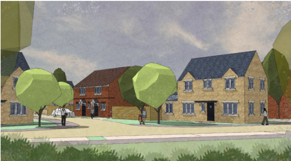
Illustrative View of Development Street