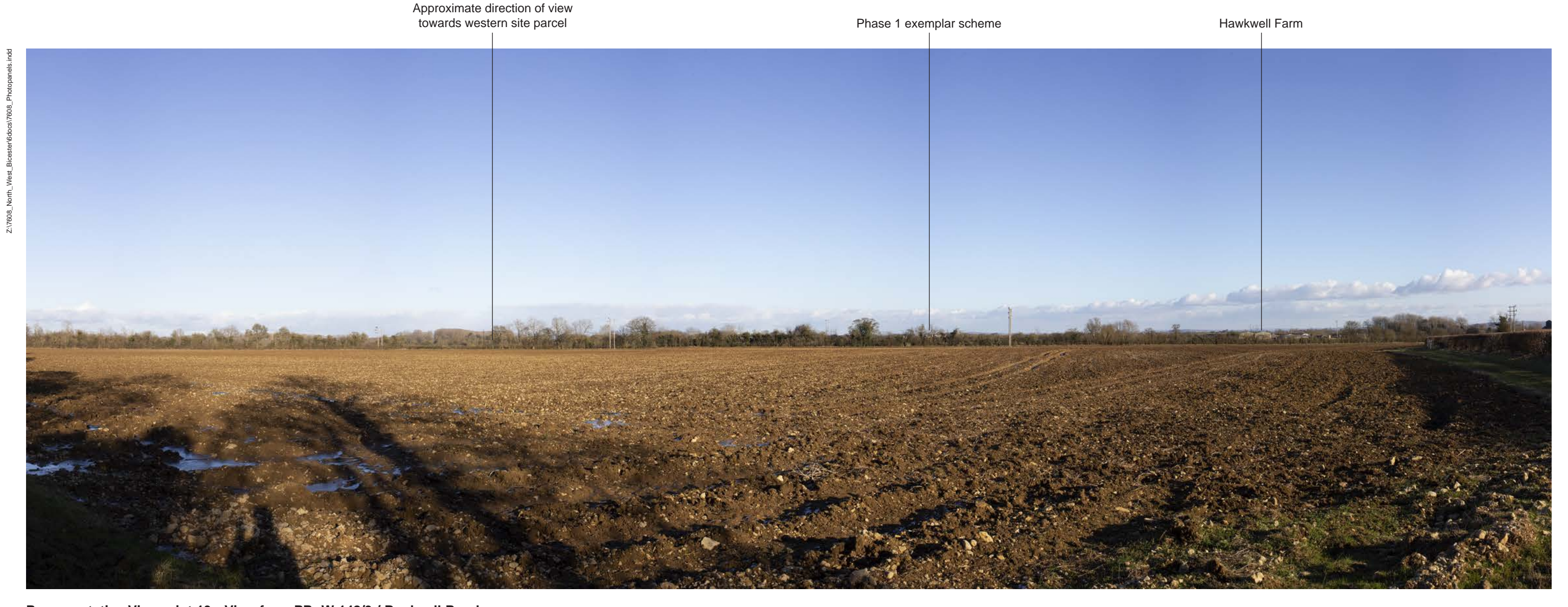
Representative Viewpoint 13 - View from PRoW 148/9 / Bucknell Road

From PRoW 148/9 / Bucknell Road to south-west of Site, views of the Eastern and Western Parcels are screened by intervening vegetation, in particular the existing woodland along the southern Development Site boundary and along the adjoining river corridor.