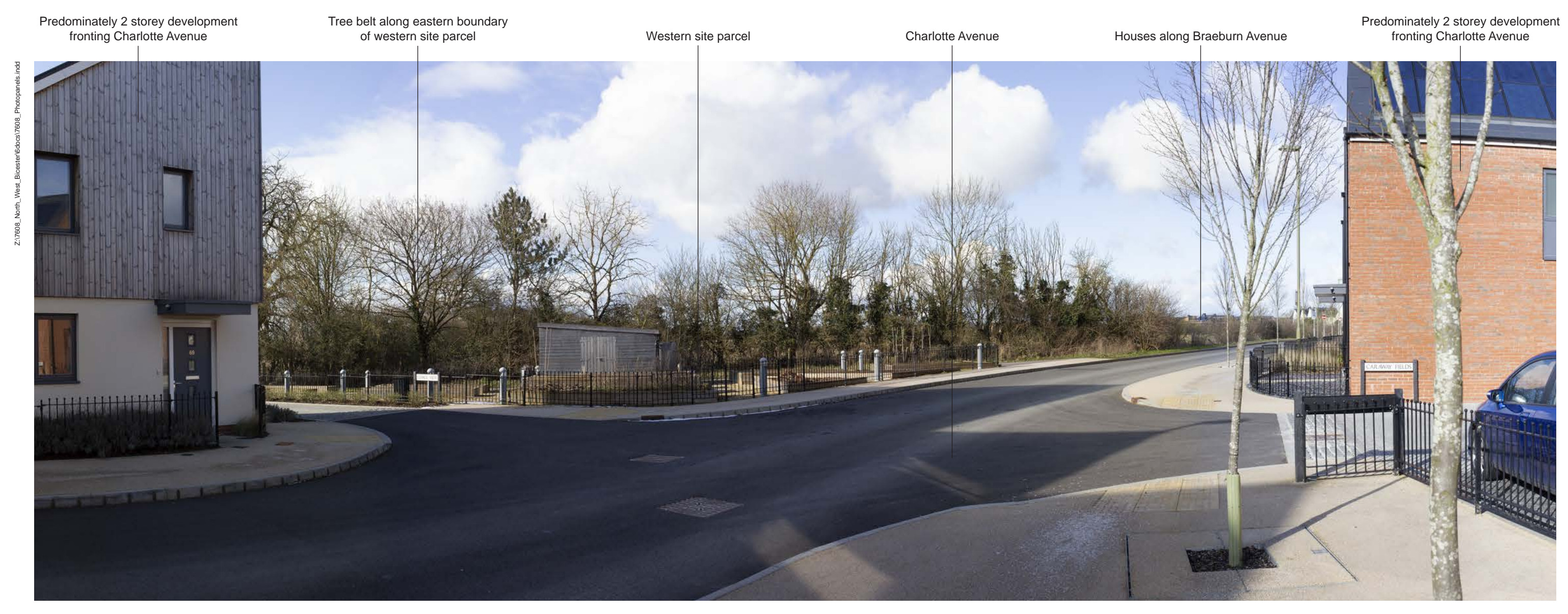
Representative Viewpoint 5 - View from Charlotte Avenue (south of Development Site)