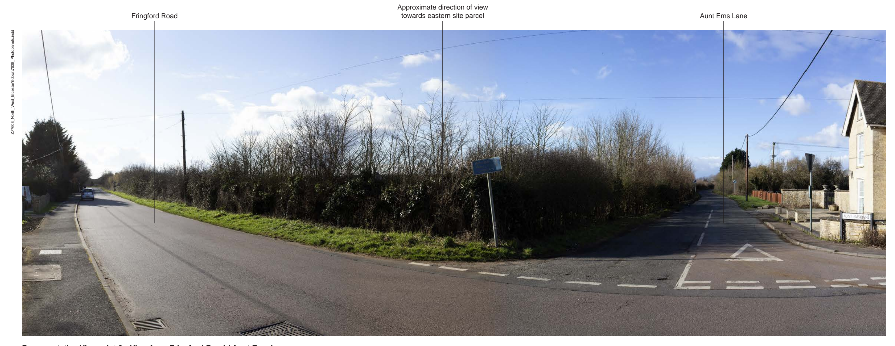
Representative Viewpoint 9 - View from Fringford Road / Aunt Ems Lane

From Caversfield residential area to the east of Site, around the junction of Fringford Road and Aunt Ems Lane, views of the Eastern and Western Parcels are screened by intervening vegetation.