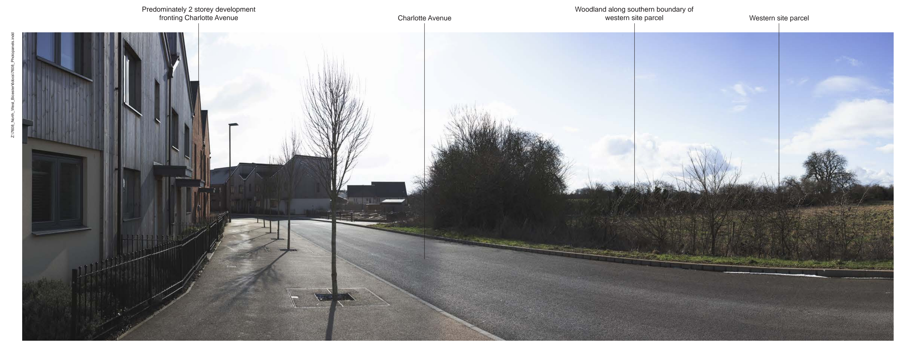
Representative Viewpoint 1 - View from Charlotte Avenue (between the Development Site Western and Eastern Parcels) - Left View

From Charlotte Avenue (between the Development Site Western and Eastern Parcels) there are relatively open, short distance views across the Western Parcel where it adjoins the road corridor. Views are filtered by a relatively low hedge along the boundary, however, there are views over the hedge and through the existing field gate. Views across the Eastern Parcel are more heavily filtered, with a narrow band of green space / planting between the road and the Site. At completion, the scale of effect would be Medium . The Development will be a prominent feature along the road corridor, visible over and above the existing hedgerow, and will alter existing views of arable fields. However, the Development will be partially screened by retained and enhance boundary vegetation and will be consistent with the existing urban context / views of housing.