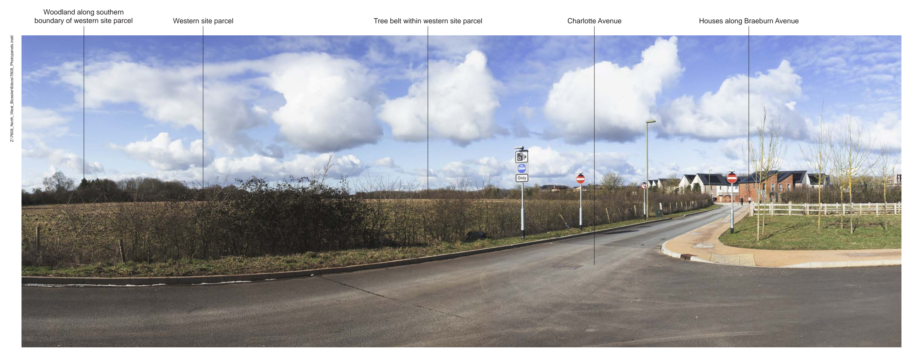
Representative Viewpoint 1 - View from Charlotte Avenue (between the Development Site Western and Eastern Parcels) - Centre View