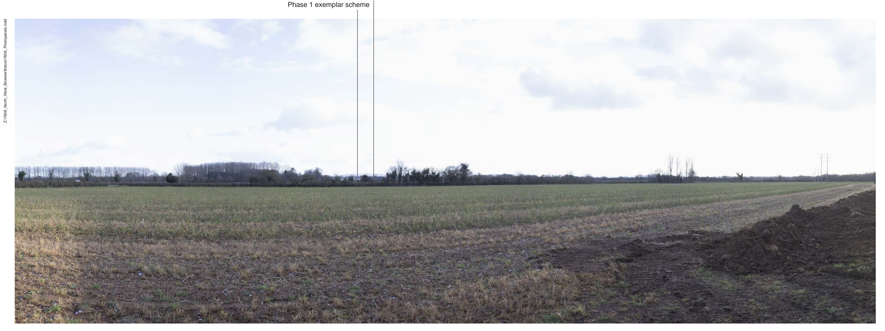
Representative Viewpoint 12 - View from junction of PRoW 148/8, B4100 and Bainton Road

Approximate direction of view towards western site parcel