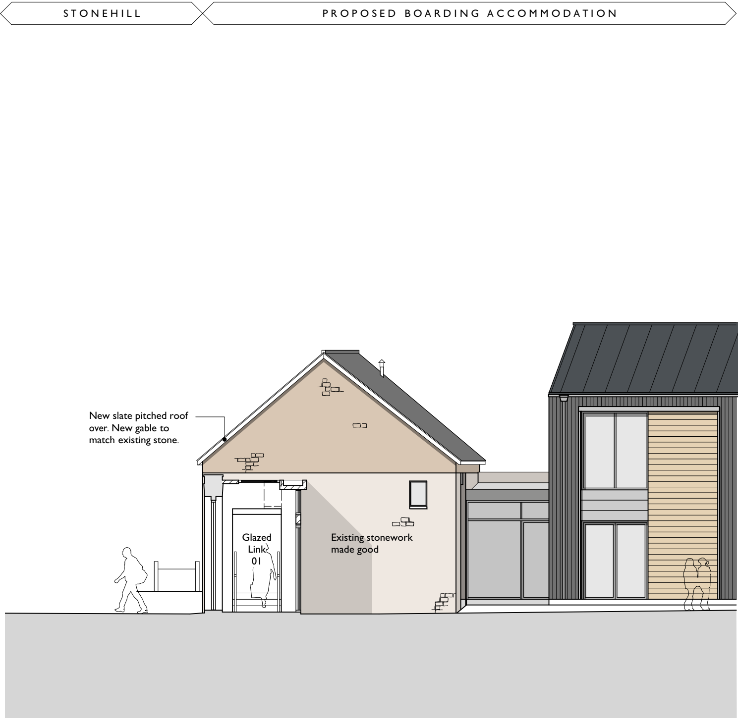
COACH HOUSE - PROPOSED EAST ELEVATION