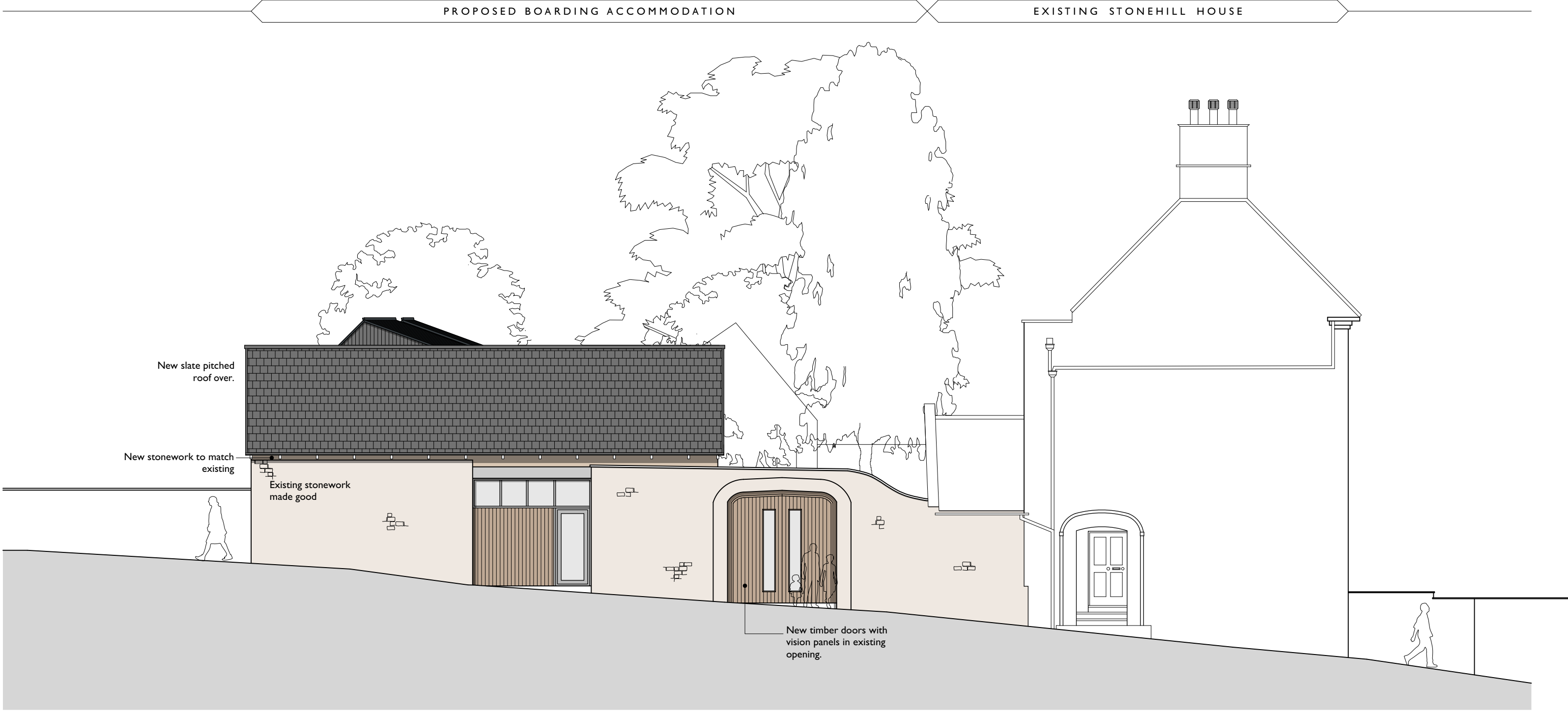
COACH HOUSE - PROPOSED SOUTH ELEVATION