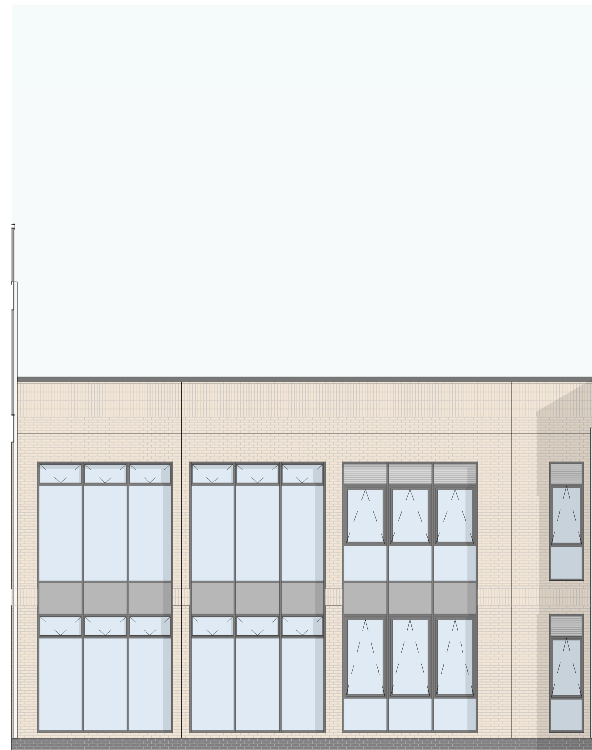
Courtyard Elevation 3 1 : 100