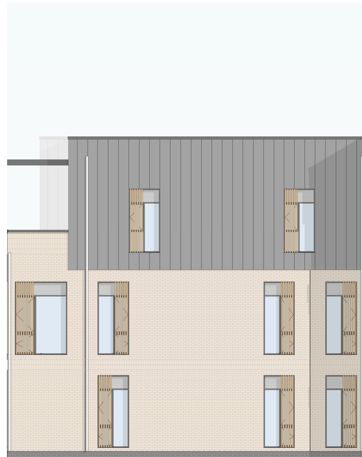
Courtyard Elevation 1 1 : 100