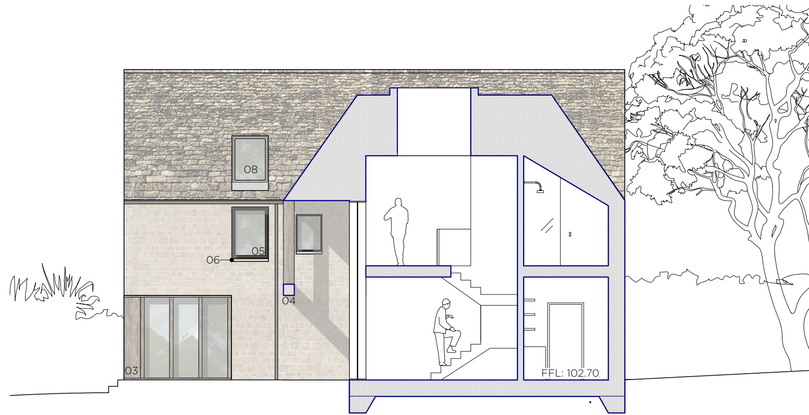
1 Proposed Section A Scale: 1:100