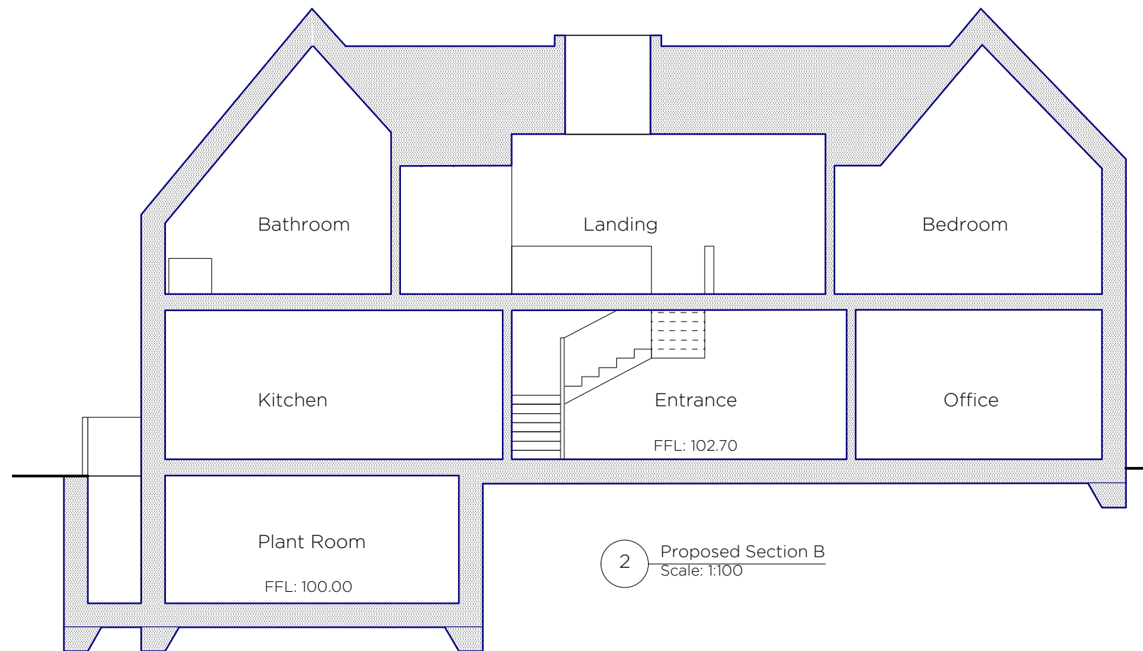
2 Proposed Section B Scale: 1:100