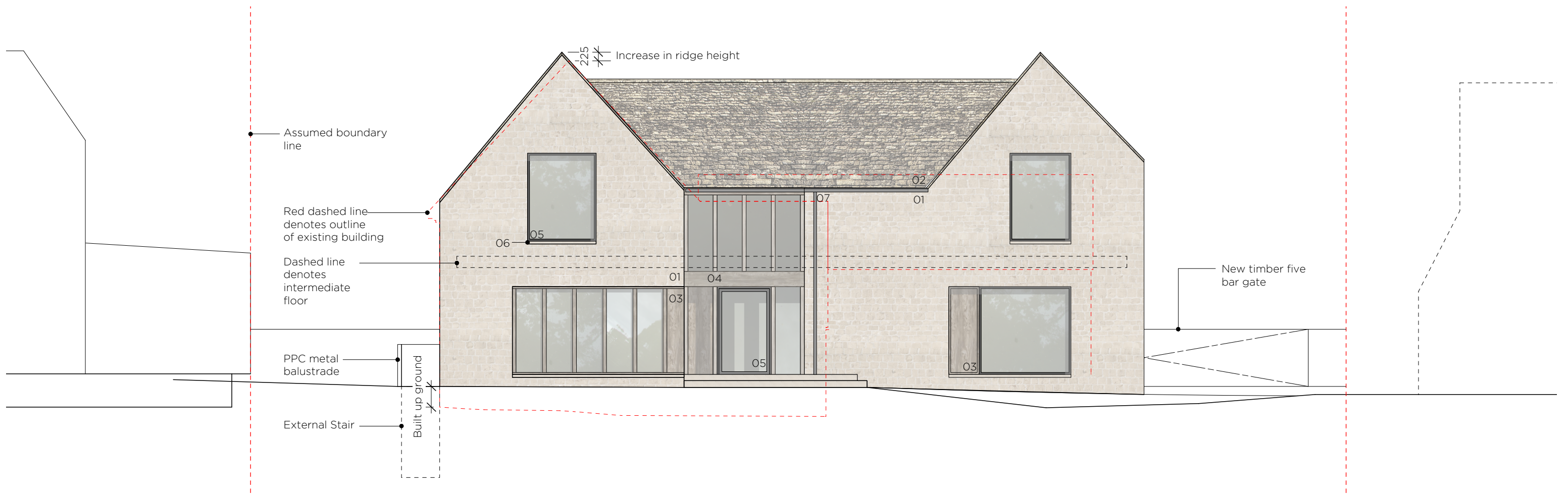
2 Proposed South Elevation Scale: 1:100