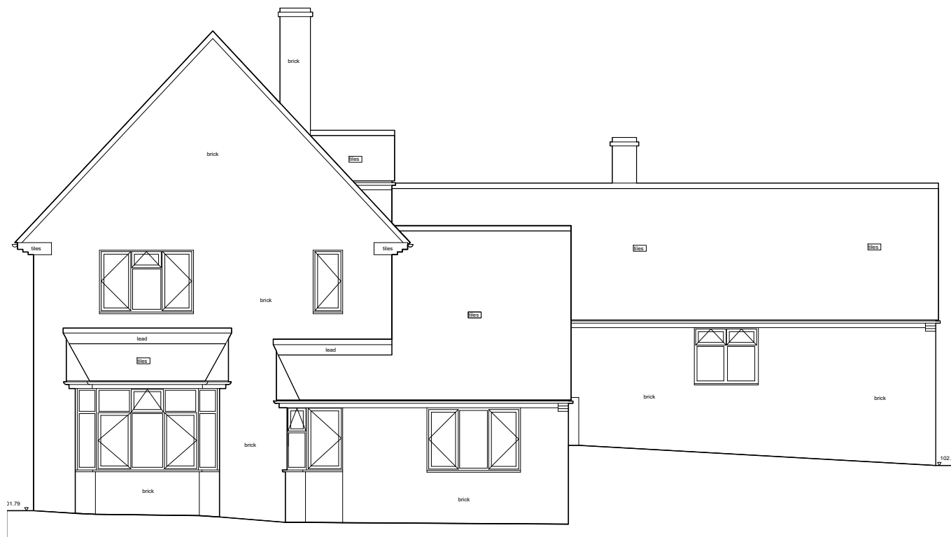
3 Existing South Elevation Scale: 1:100