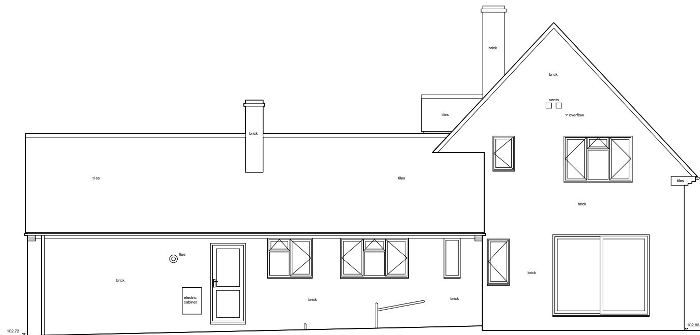
1 Existing North Elevation Scale: 1:100