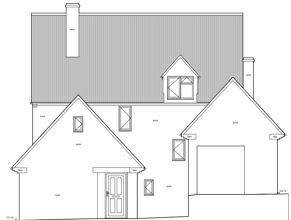
2 Existing East Elevation Scale: 1:100