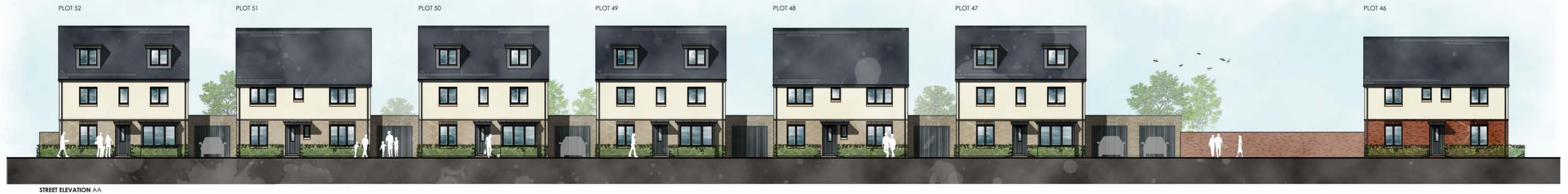
STREET ELEVATION AA