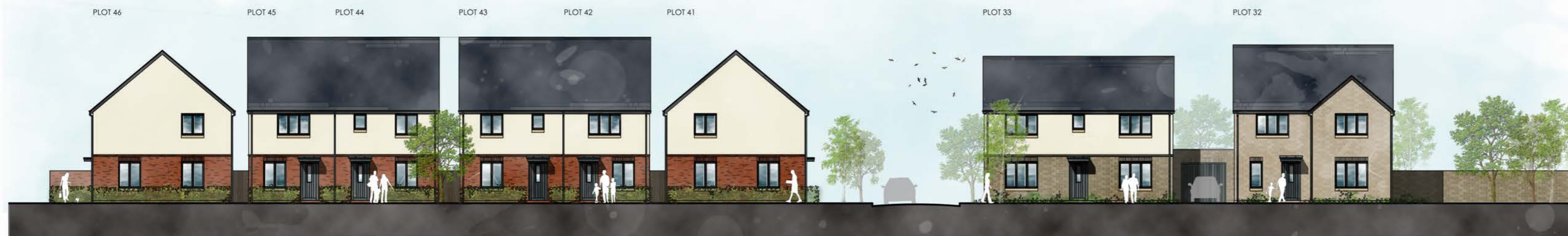
STREET ELEVATION BB