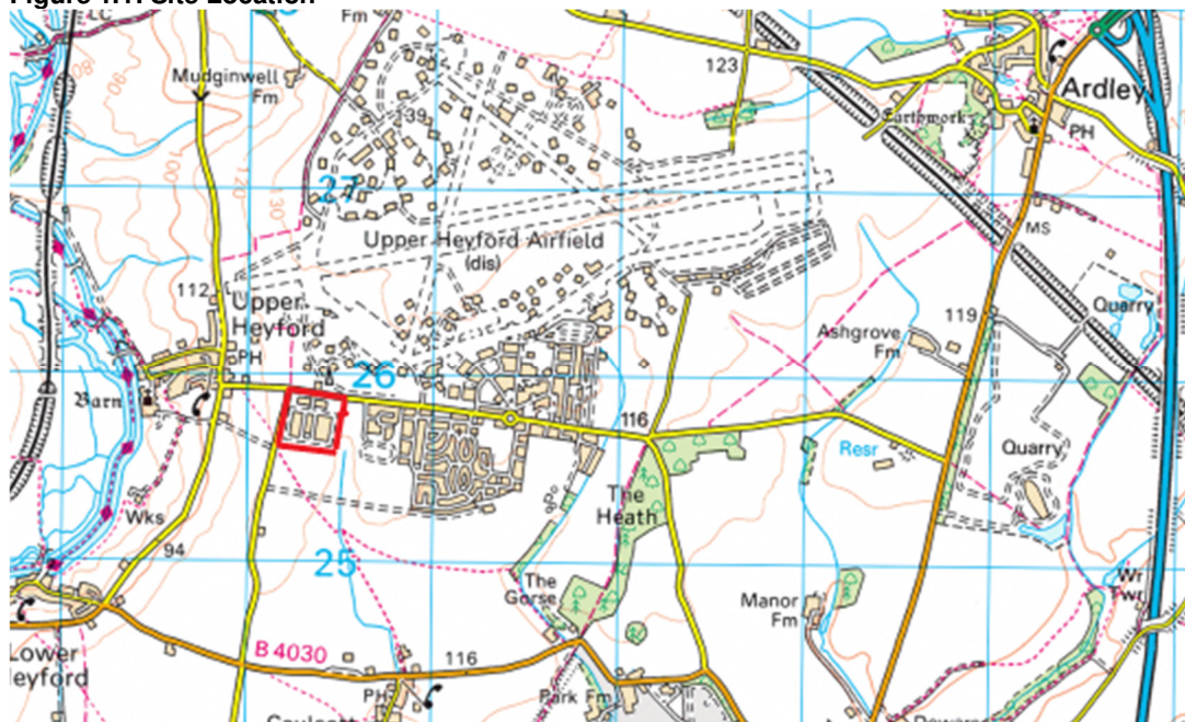
Figure 1.1: Site Location