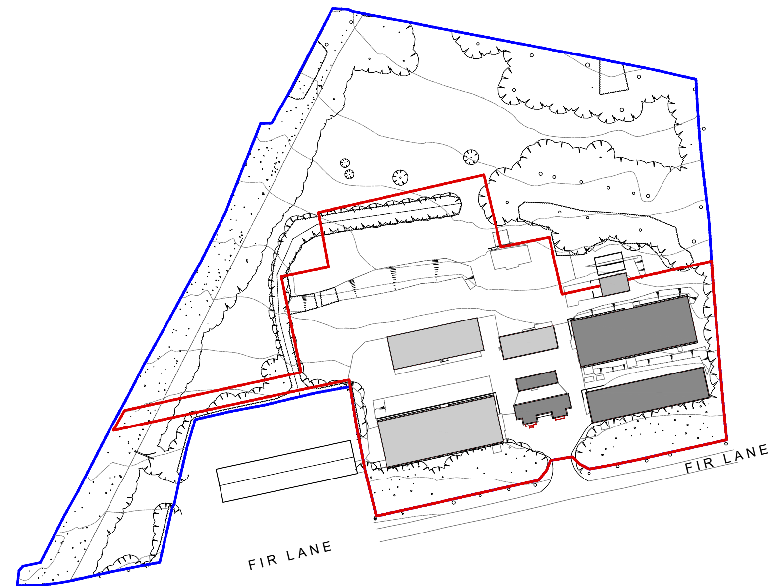
1 Location Plan Scale: 1:1250