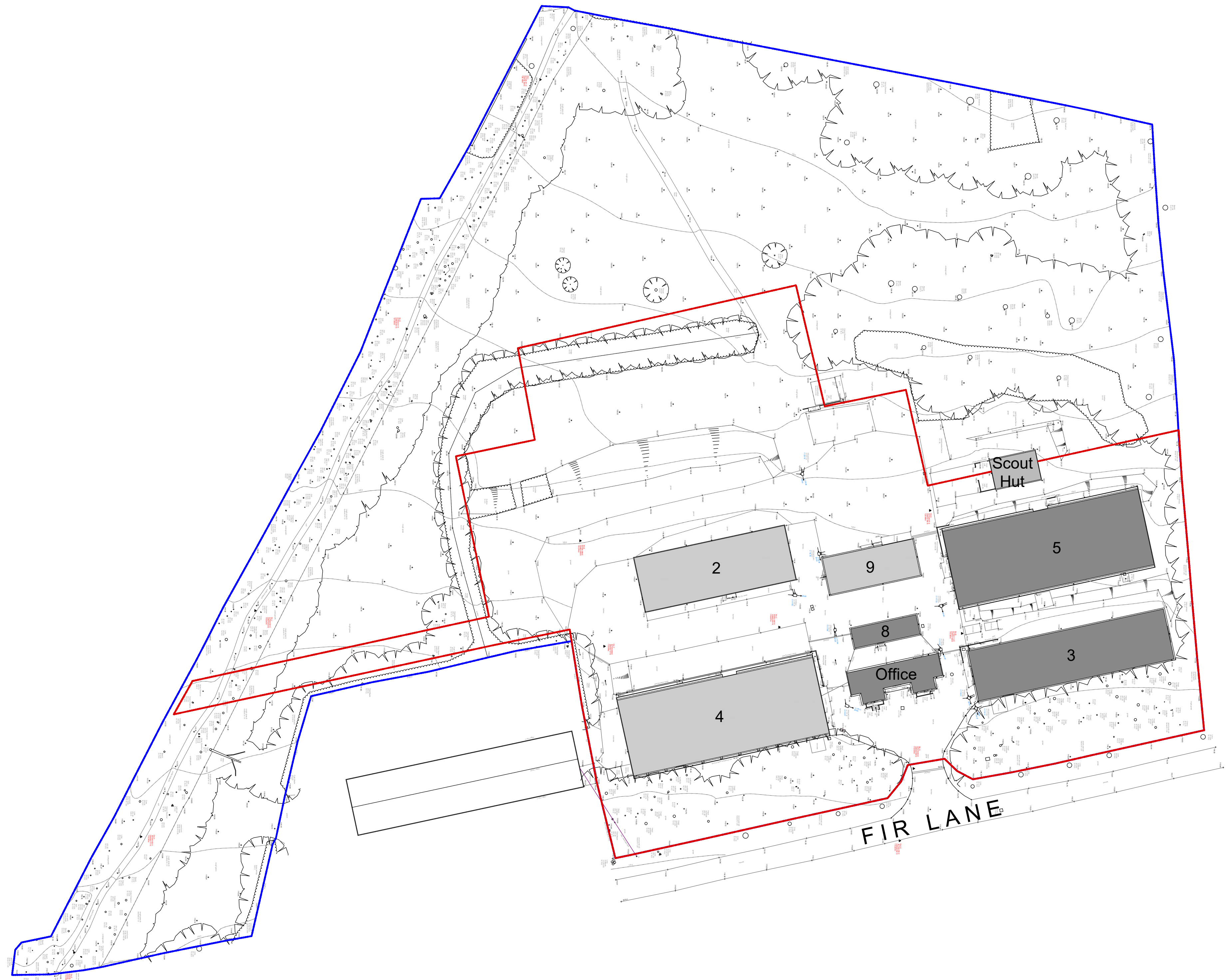
2 Existing Site Survey Scale: 1:500