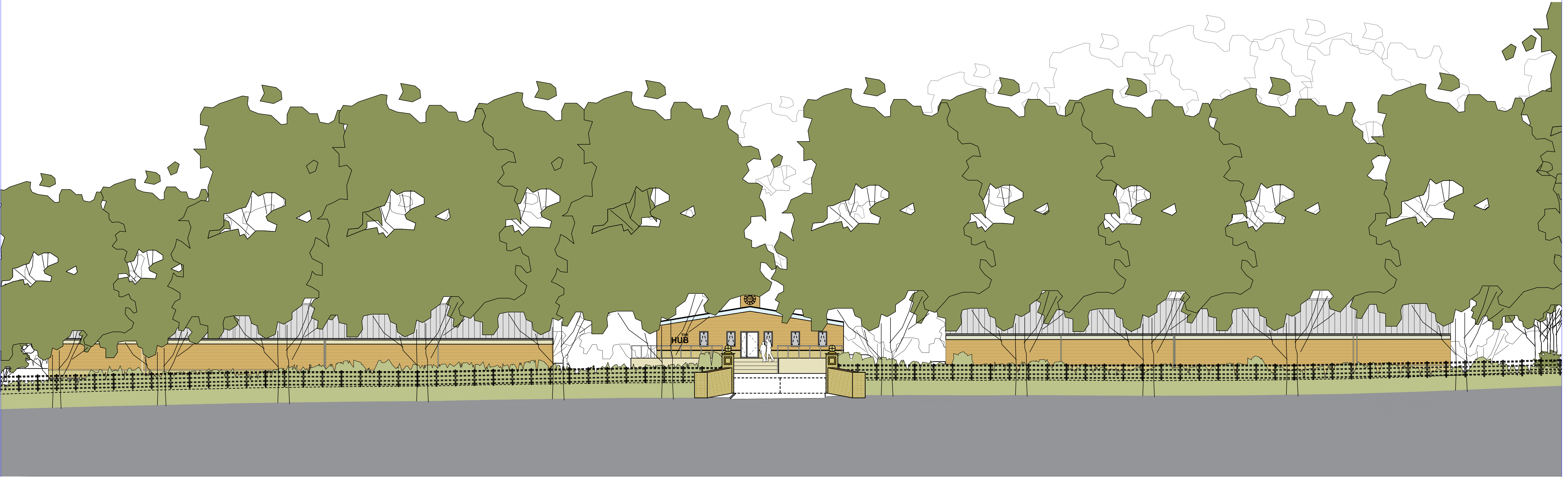
1 Proposed Section C-C Scale: 1:150