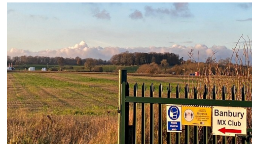
Permanent signs - main track gate off single-track lane

First of all, it is important to state that I am a keen supporter of motorsport and the concept of sport for all. I am also experienced in organising motorsport in rural locations. Most notably, I have been a stage commander for the October Rally Festival in my island home of Jersey, on behalf of Jersey Motorcycle and Light Car Club (JMCLCC) – see pictures above. I have hosted the club's spring festival on my island farm, with even my cows enjoying the spectacle. I know how to be a responsible landowner and how to ensure that prime agricultural land is not adversely affected and agricultural features restored after each event. This knowledge and experience – along with my ongoing role as farmer and landowner and my 'doorstep view' of everything that has gone on with Wroxton track as it is right in front of my home – cause me to object even more strongly to this planning application.