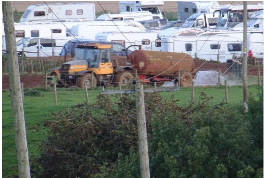
A bowser soaks the track before racing using water abstracted, without permit, from the brook

Another question should be posed: how is the track currently licensed and through which sporting body? I pose this question as, given the tenuous legitimacy of the existence and use of the track, one wonders if the competitors' and event managers' insurance policies are valid or void?