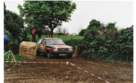
Sustainable motorsport on rural land-how it should look

I object most strongly to this planning application.