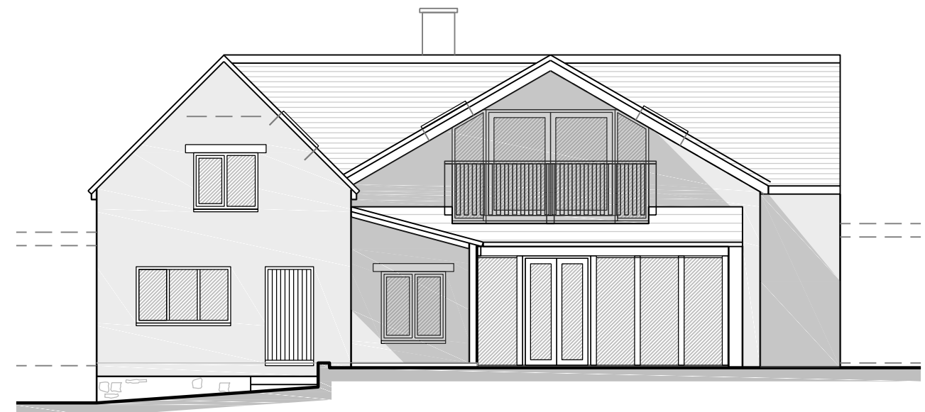
Existing South (Back) Elevation Scale: 1:100