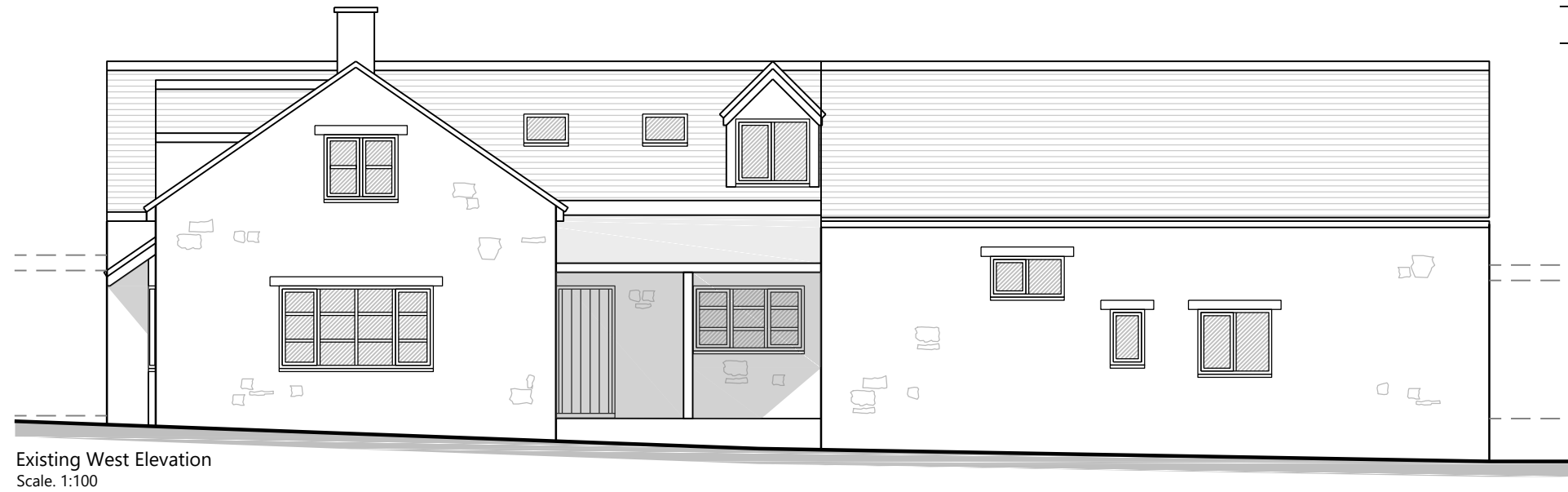
Existing West Elevation Scale: 1:100

Materials: Walls: Random coursed Ironstone & White Render Roof: Interlocking Concrete plain tiles Dormers: Timber clad and rendered Windows: Timber & glazed casements (white) Doors: Timber (either white or natural wood)