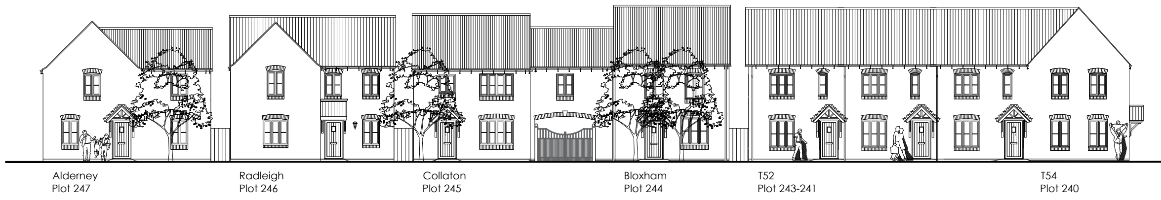
Street Scene Plot 240-247 Neighbourhood Character Area