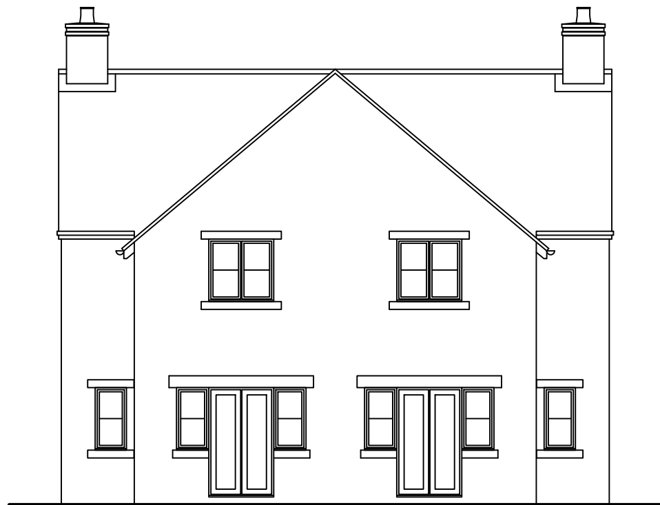
PLOT 12 REAR ELEVATION