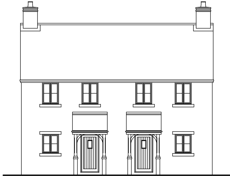
PLOT 11 FRONT ELEVATION