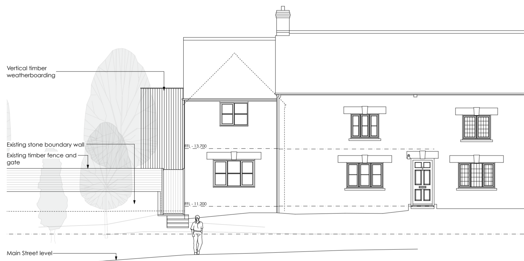
ELEVATION 1 - SOUTH