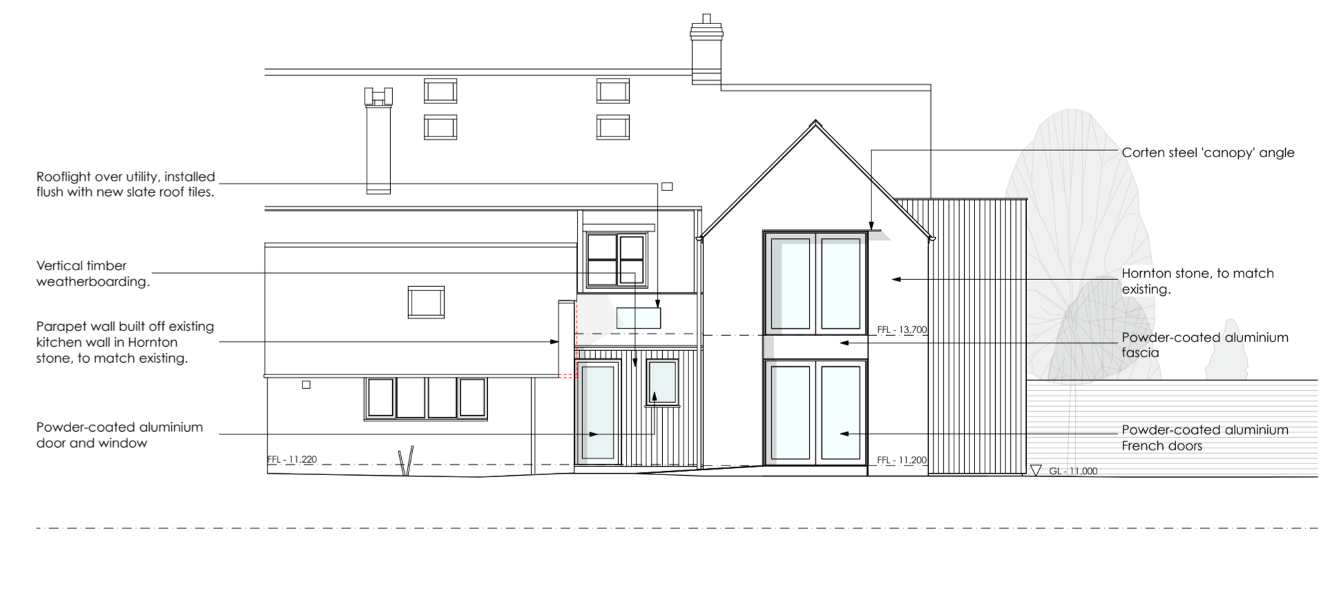
ELEVATION 3 - NORTH