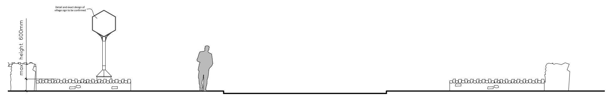
ELEVATION B-B - Planters Either Side of Clifton Road 1:100