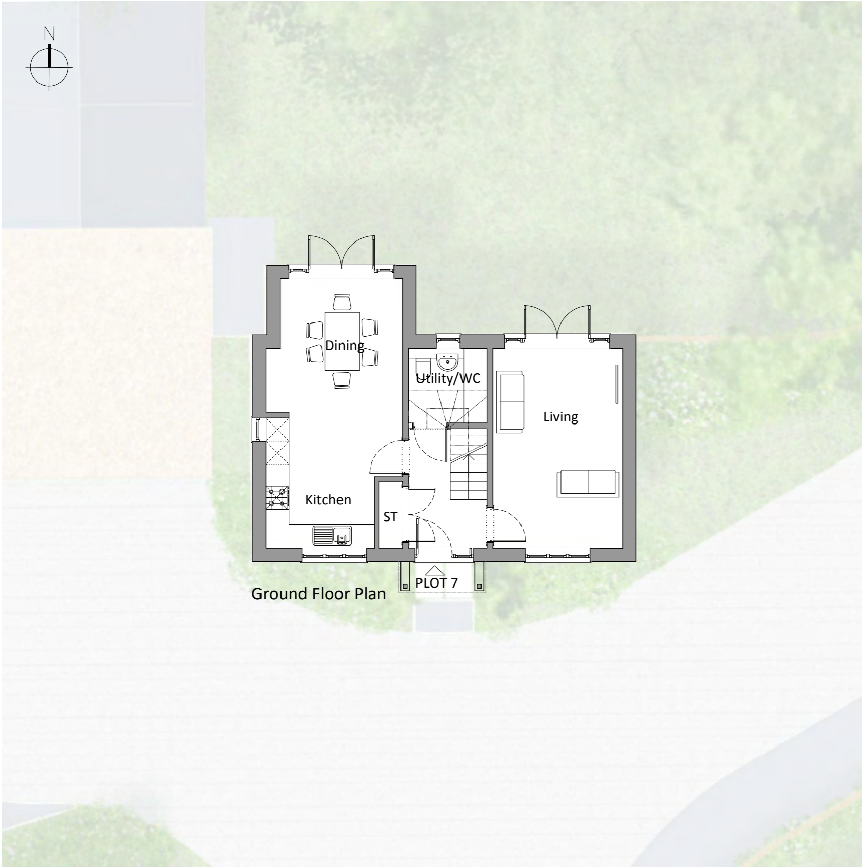
Ground Floor Plan PLOT 7