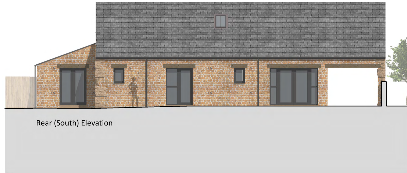
Rear (South) Elevation