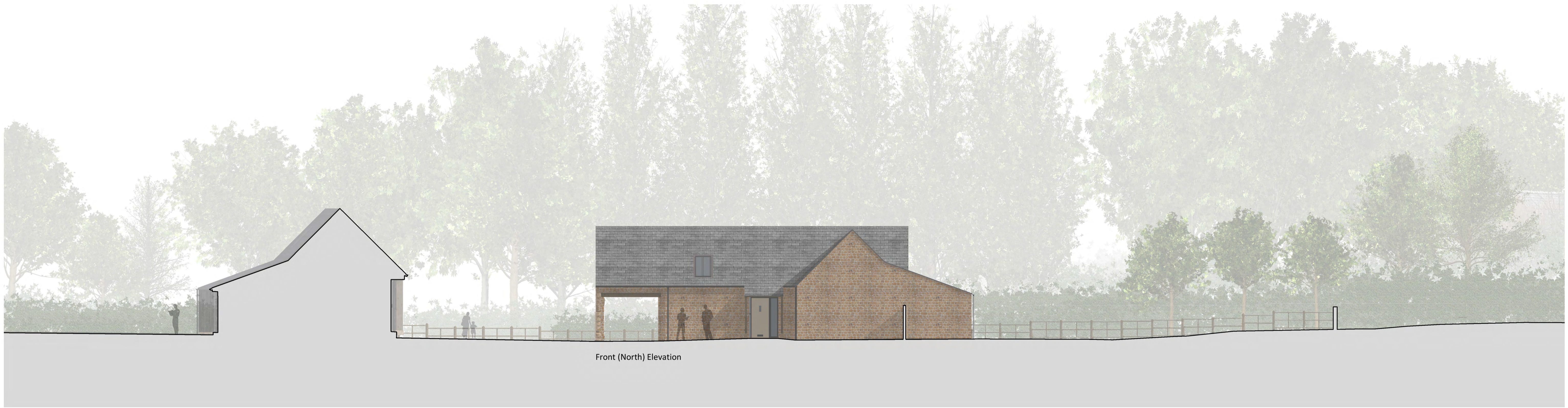
Front (North) Elevation