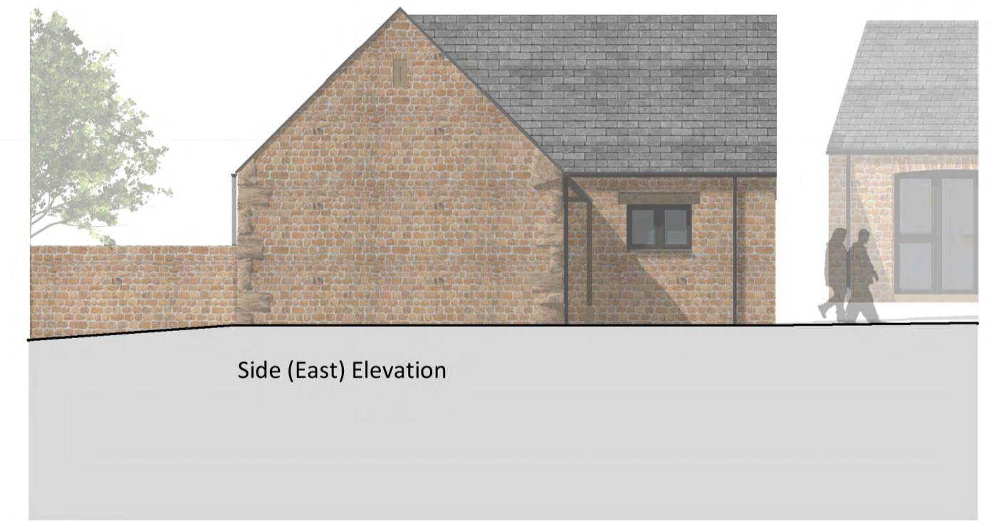
Side (East) Elevation

The Poplars, Land South of Clifton Road Deddington Plot 3 Elevations