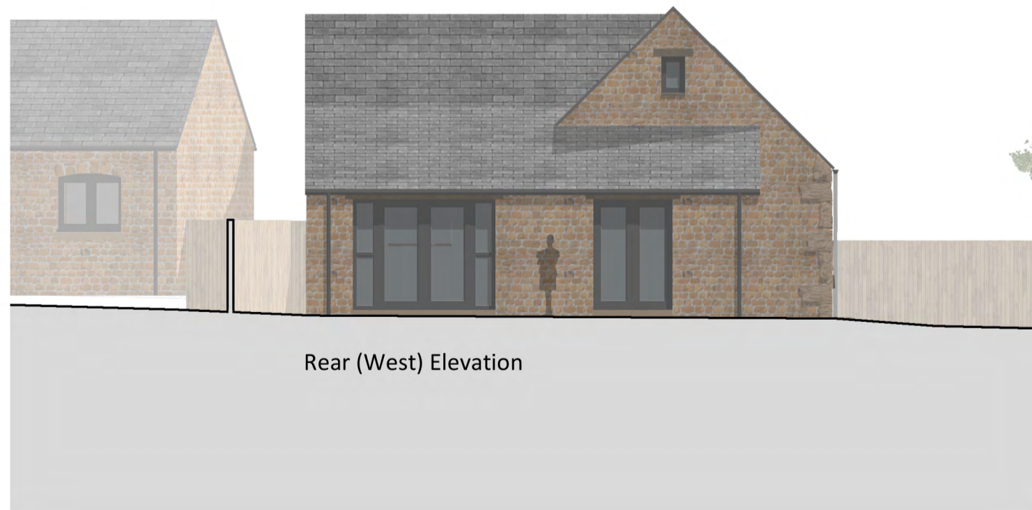
Rear (West) Elevation