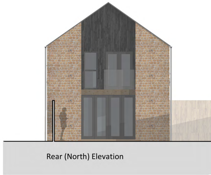
Rear (North) Elevation