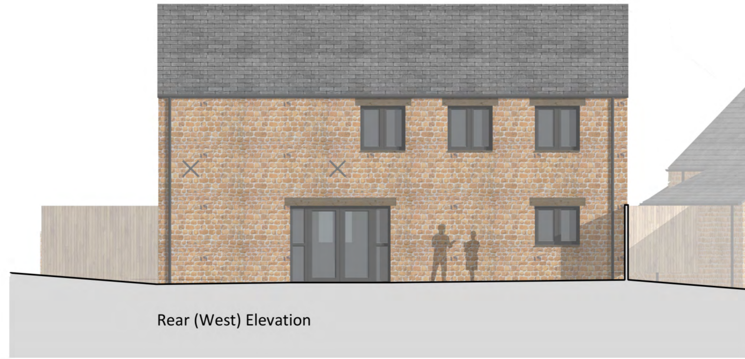
Rear (West) Elevation