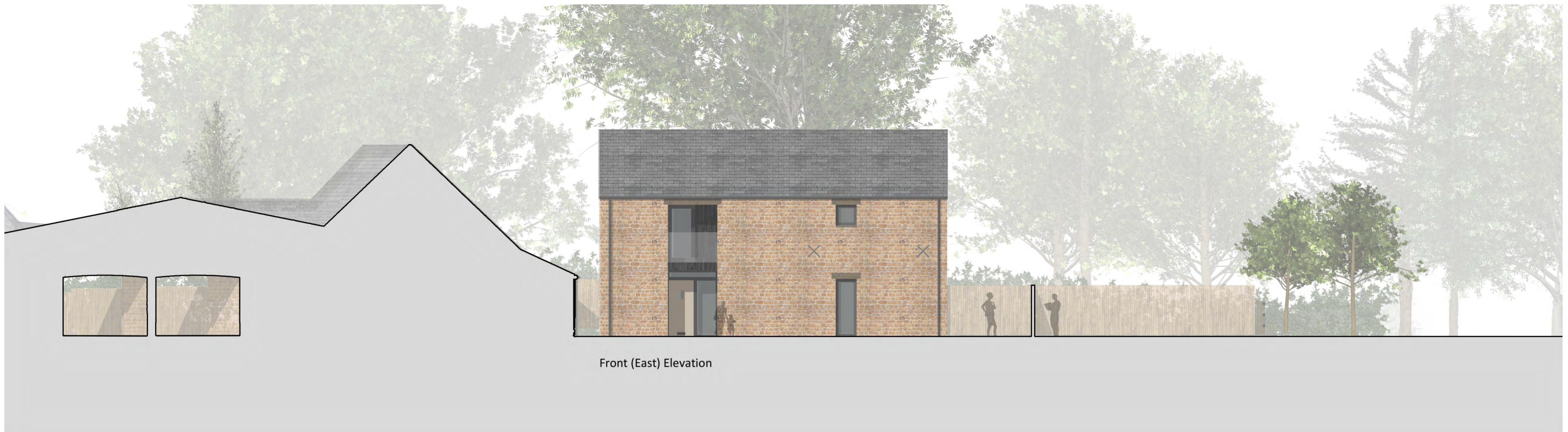
Front (East) Elevation