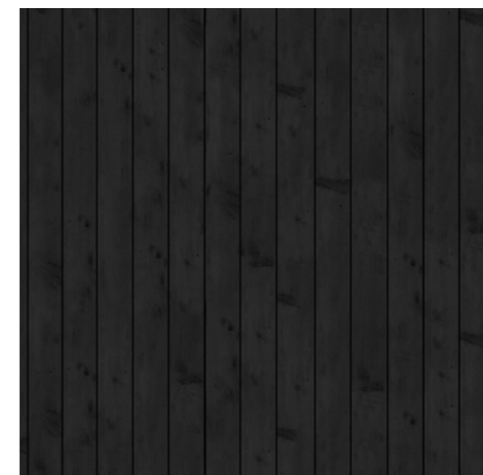
Black Painted Vertical Timber Cladding