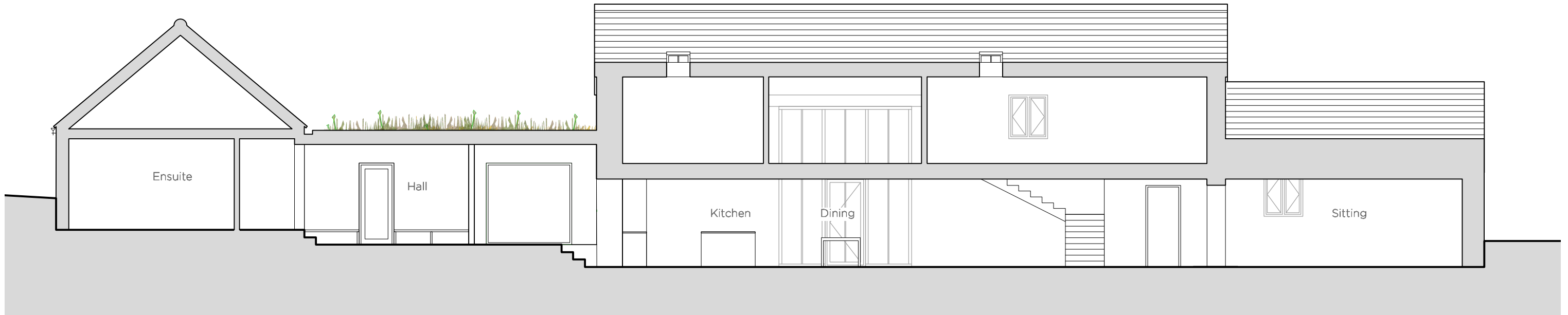
1 Proposed Section AA Scale: 1:100