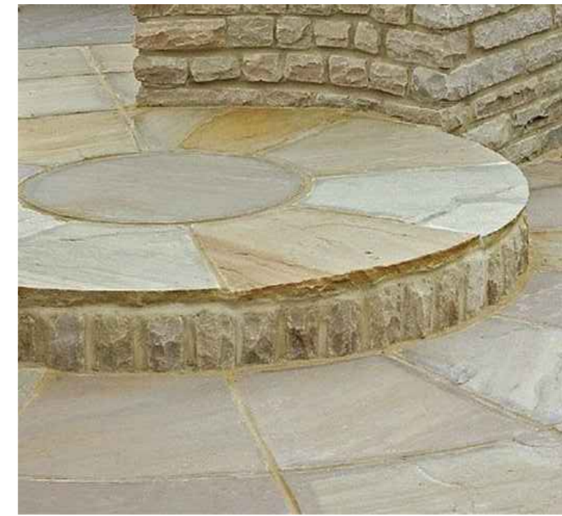
Dwarf stone wall with paving tiles