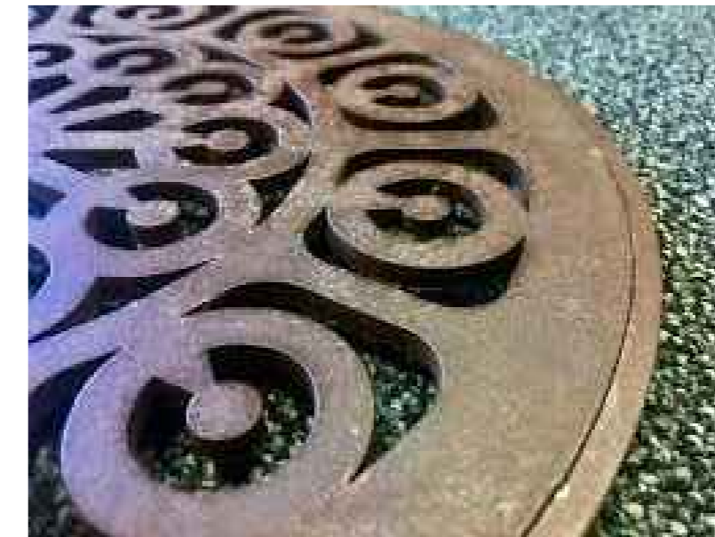
Example of decorative drainage grate

All Pumps Direct £274.96 Delivered primed, needs painted. Will lift 6m if used with a proper spring loaded footvalve and airtight hose and clips (1/4" footvalve package)