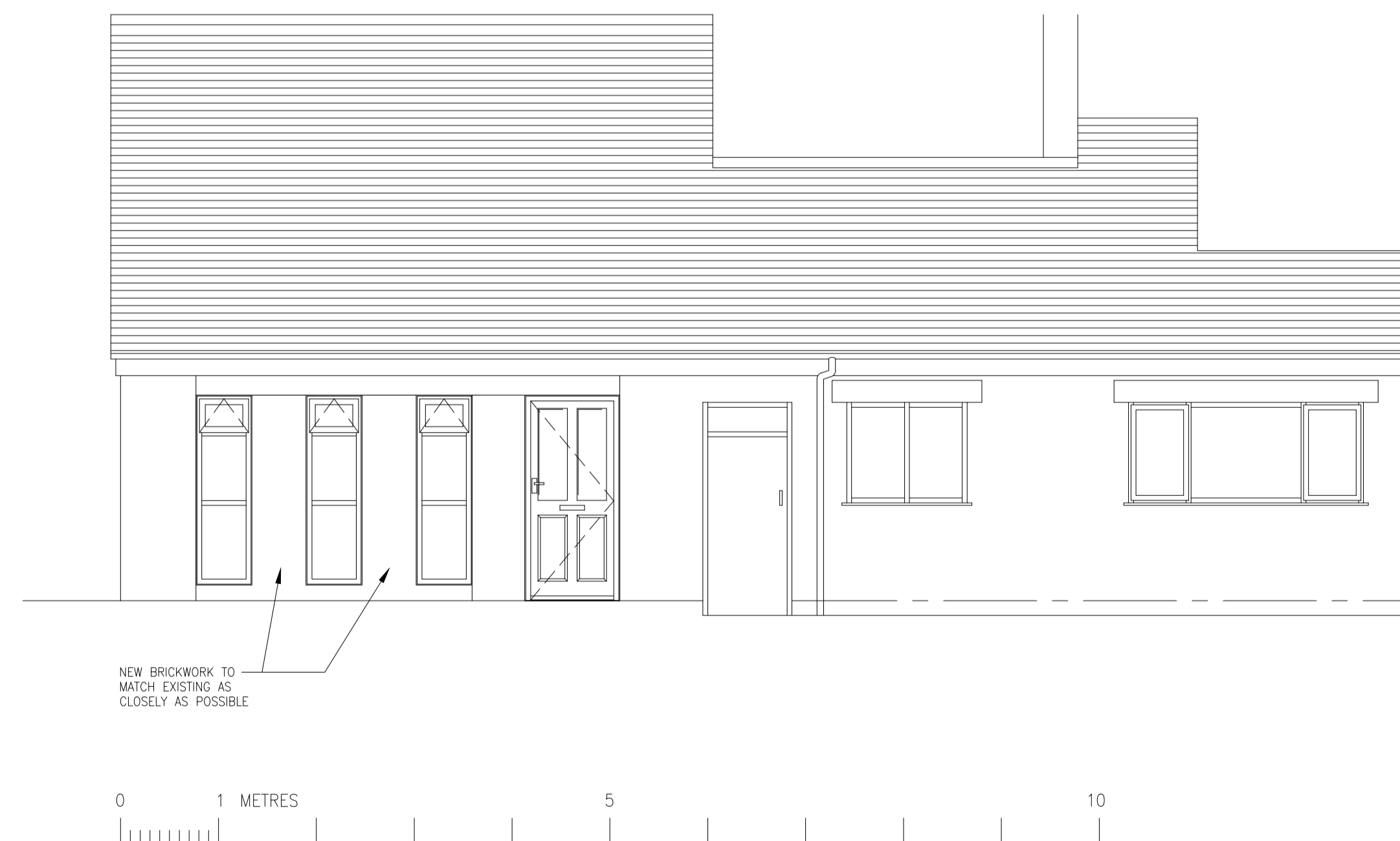
PART WEST ELEVATION (FRONT)