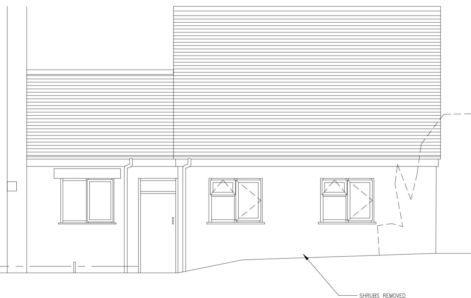
PART EAST ELEVATION