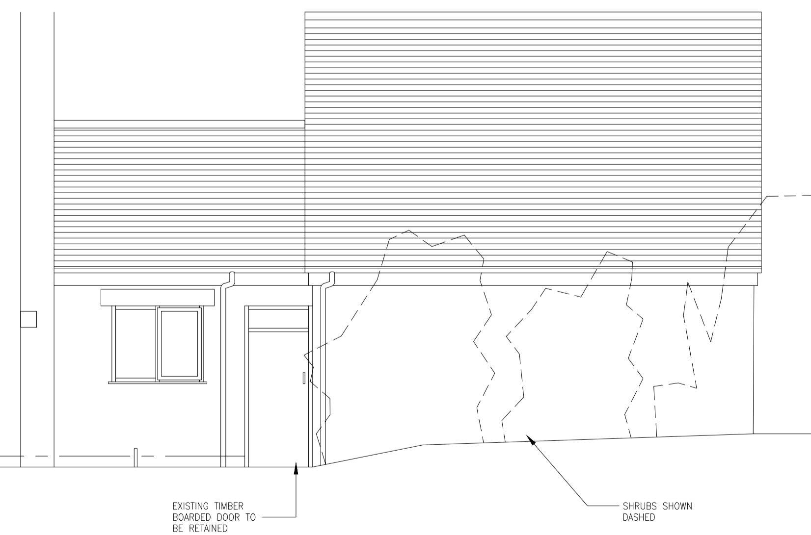
PART EAST ELEVATION